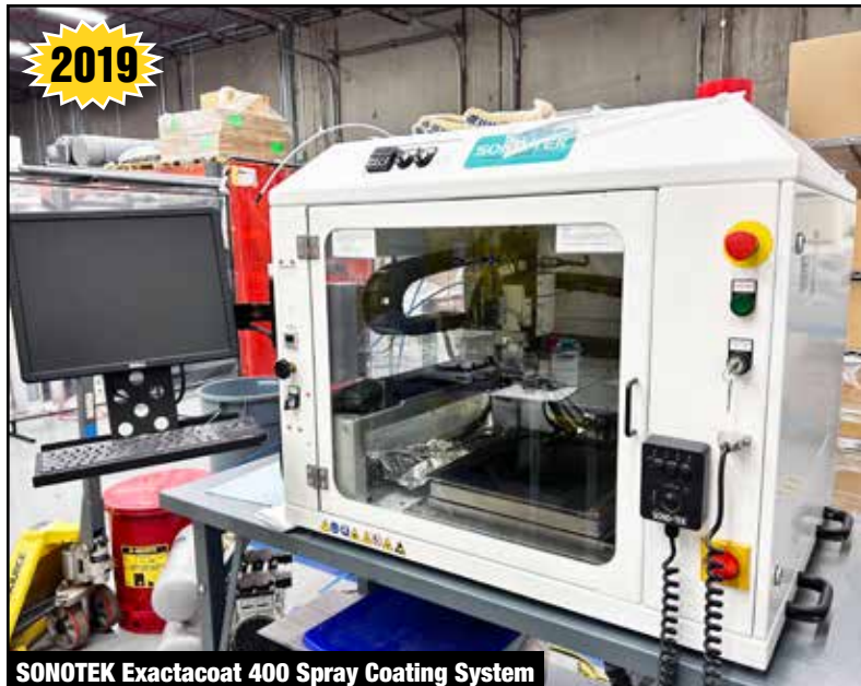
SONOTEK Exactacoat 400 Spray Coating System

Maynards Industries Canada Ltd. SINCE 1902 AUCTIONS | LIQUIDATIONS | APPRAISALS