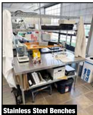
Stainless Steel Benches