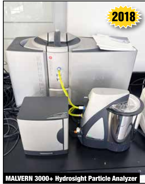
MALVERN 3000+ Hydrosight Particle Analyzer