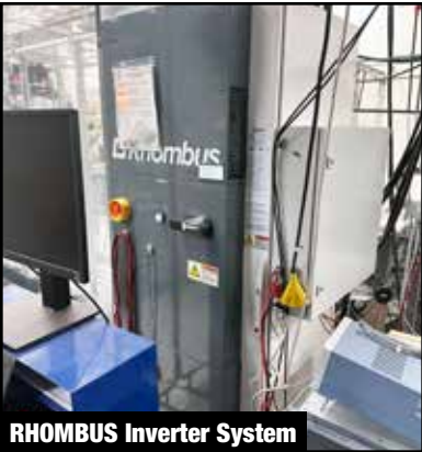
RHOMBUS Inverter System