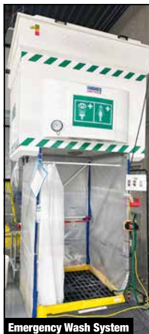
Emergency Wash System