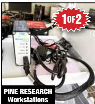
PINE RESEARCH Workstations