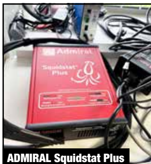
ADMIRAL Squidstat Plus