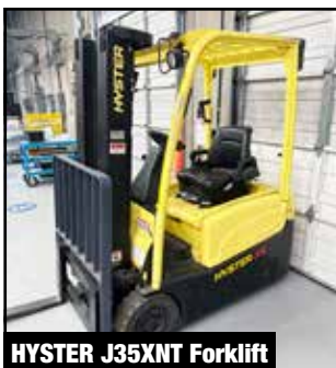
HYSTER J35XNT Forklift