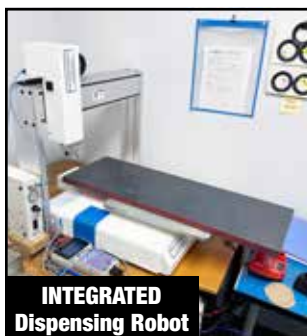
INTEGRATED Dispensing Robot