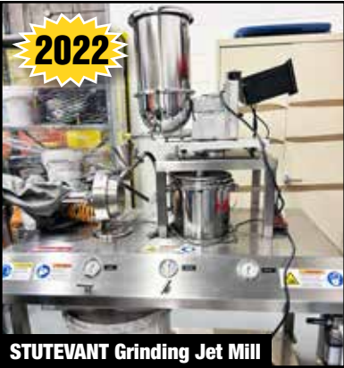
STUTEVANT Grinding Jet Mill

PLACE YOUR BID NOW! Register at bidspotter.com or maynards.com