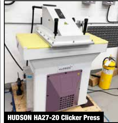
HUDSON HA27-20 Clicker Press