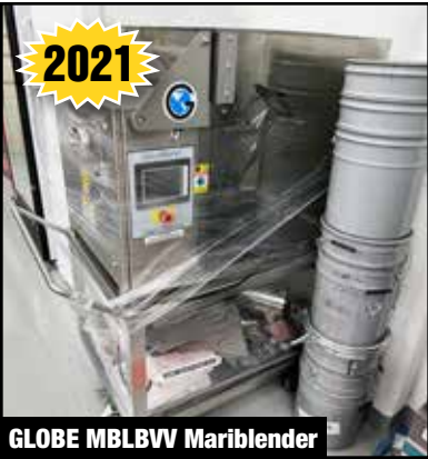
GLOBE MBLBV Mariblender