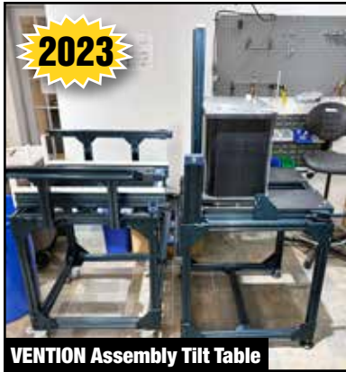
VENTION Assembly Tilt Table