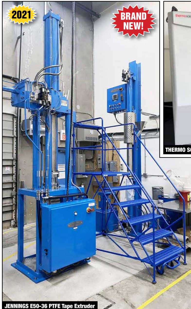
JENNINGS E50-36 PTFE Tape Extruder