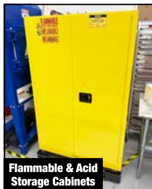
Flammable & Acid Storage Cabinets