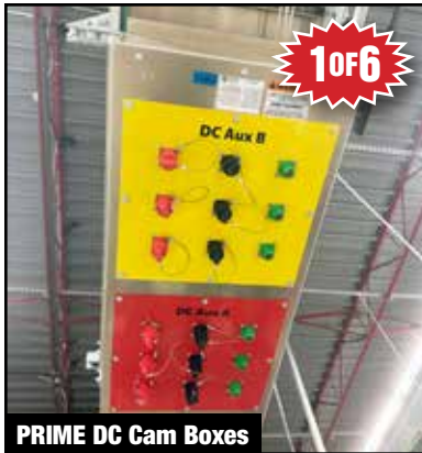
PRIME DC Cam Boxes