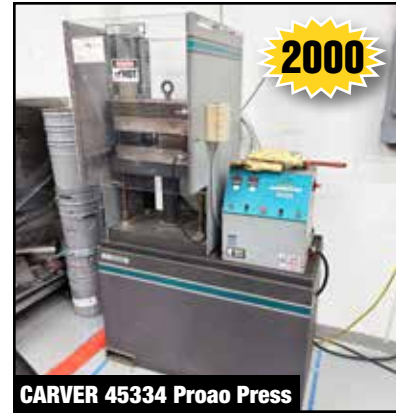
CARVER 45334 Proao Press