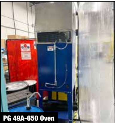
PG 49A-650 Oven