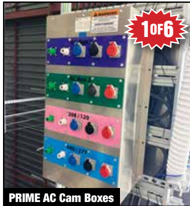
PRIME AC Cam Boxes