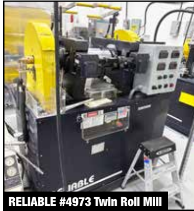
RELIABLE #4973 Twin Roll Mill