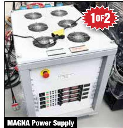
MAGNA Power Supply