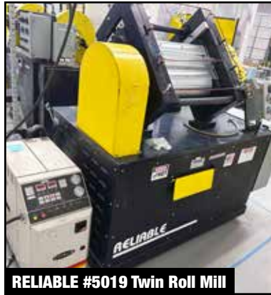
RELIABLE #5019 Twin Roll Mill