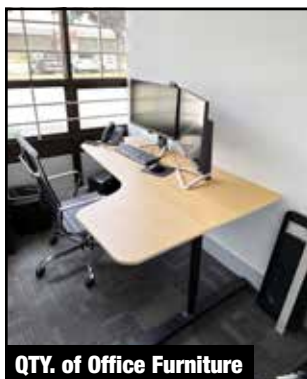
QTY. of Office Furniture

• HYSTER J35XNT Forklift 3,450 lb. cap. • NEW EXTRUSION Spec-Grade, DC-09186, 99.95 Alloy, 16.06" Length • QTY. of Hand Tools & Precision Instruments • PROSLAT Tool Chest • BYNFOR Pro Tool Box • SYSTAINER 3 S02-NN Shaper Hub • MITUTOYO 99MAD027M3 Caliper • HAKO Soldering System • SAS Portable Fume Extractor • ROSSEAU Cabinets • Fittings Bins, Shop Carts • KING 17" Drill Press • CENTRAL MACHINERY 7"x10" Mini Lathe • KING Metal Band Saw 4"x6" • (5) CALIFORNIA Portable Air Compressors • KING KC0705L-6 Belt/Disc Sander • Hyd. Die Cart • Electric/Hydraulic Lifter 2,000 lb. cap. • 2023 WESCO Drum Hoist • Pallet Jacks • QTY. of Lab & Stainless Steel Tables, Adjustable Chrome Shelves • QTY. of Offices, CPU's, Boardroom, Lunchroom & Much More