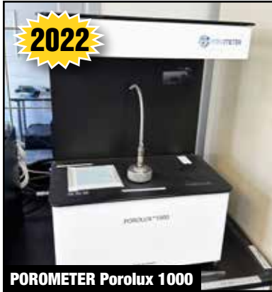
POROMETER Porolux 1000