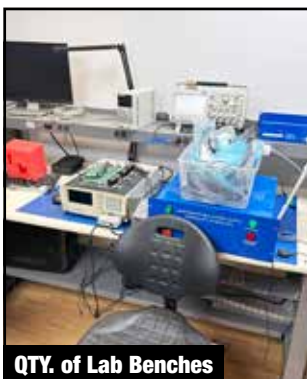
QTY. of Lab Benches