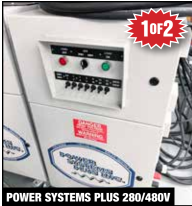
POWER SYSTEMS PLUS 280/480V