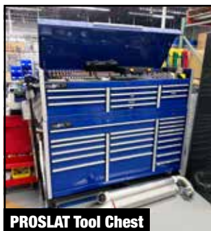
PROSLAT Tool Chest