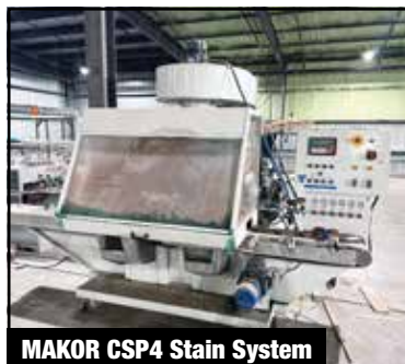
MAKOR CSP4 Stain System