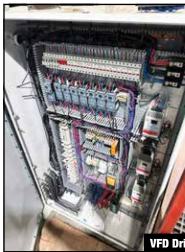
VFD Drive Control