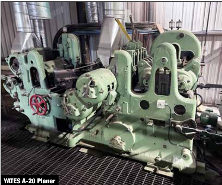
YATES A-20 Planer