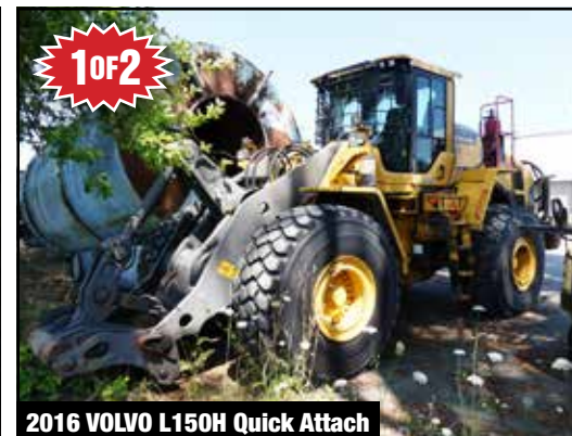
2016 VOLVO L150H Quick Attach

Maynards Industries Canada Ltd. SINCE 1902 AUCTIONS | LIQUIDATIONS | APPRAISALS