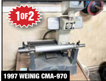
1997 WEINIG CMA-970