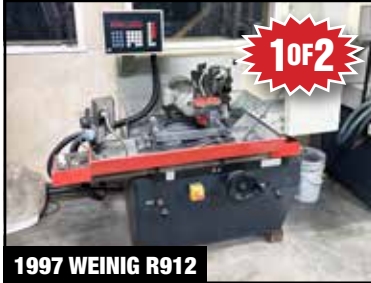
1997 WEINIG R912