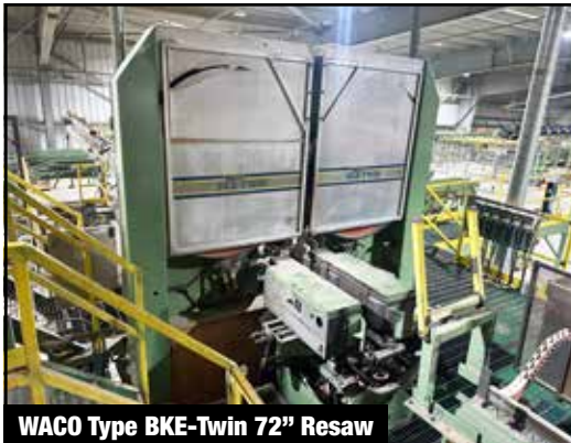
WACO Type BKE-Twin 72" Resaw