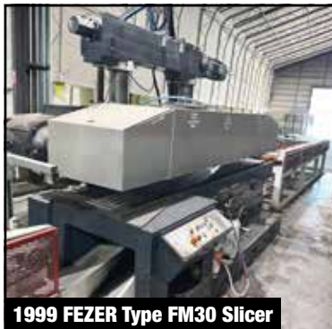
1999 FEZER Type FM30 Slicer