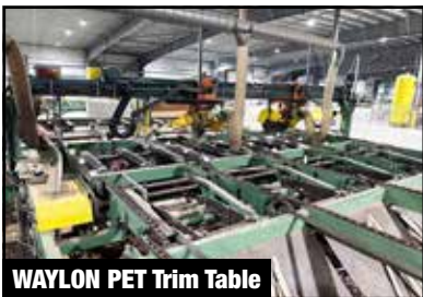
WAYLON PET Trim Table