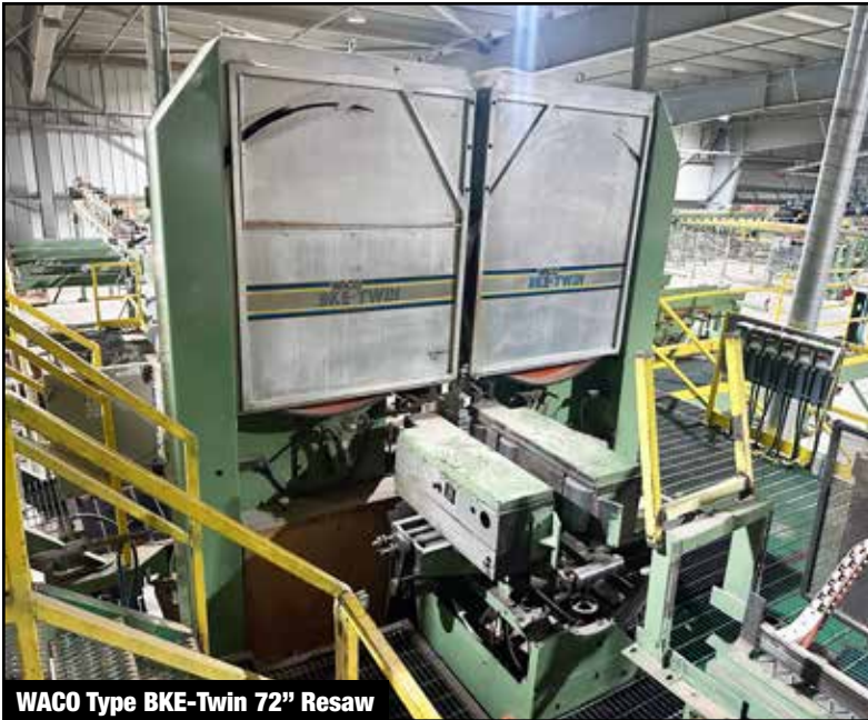
WACO Type BKE-Twin 72" Resaw

4000 STAMP AVENUE • PORT ALBERNI, BC VANCOUVER ISLAND