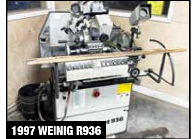
1997 WEINIG R936