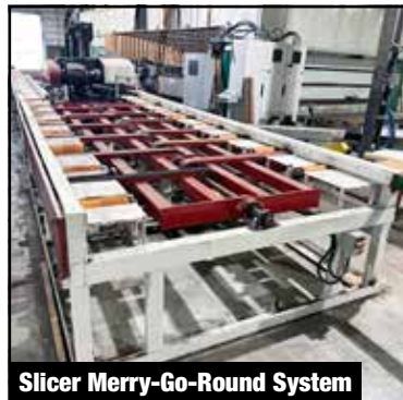
Slicer Merry-Go-Round System