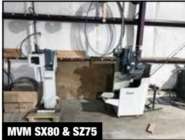
MVM SX80 & SZ75