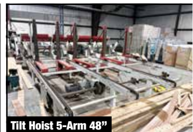
Tilt Hoist 5-Arm 48"