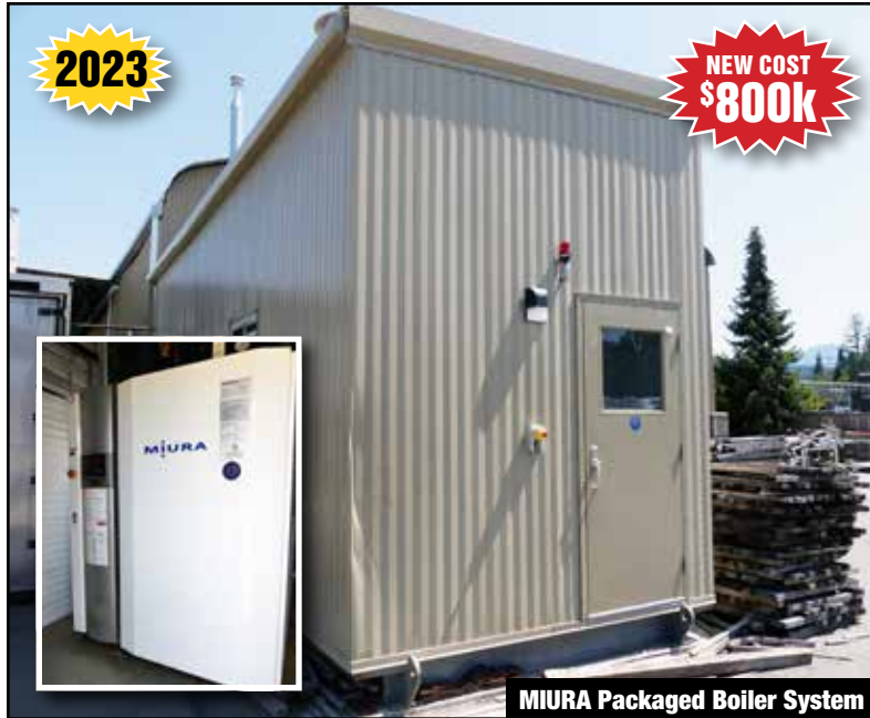
MIURA Packaged Boiler System