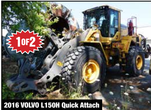
2016 VOLVO L150H Quick Attach