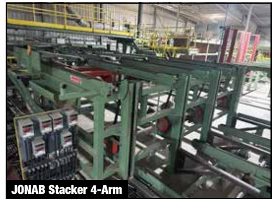
JONAB Stacker 4-Arm