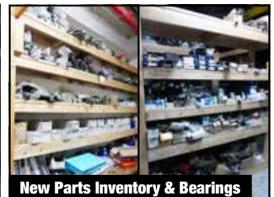
New Parts Inventory & Bearings