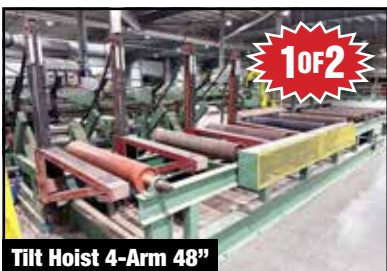
Tilt Hoist 4-Arm 48"