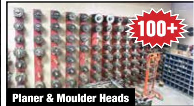
Planer & Moulder Heads