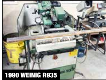
1990 WEINIG R935