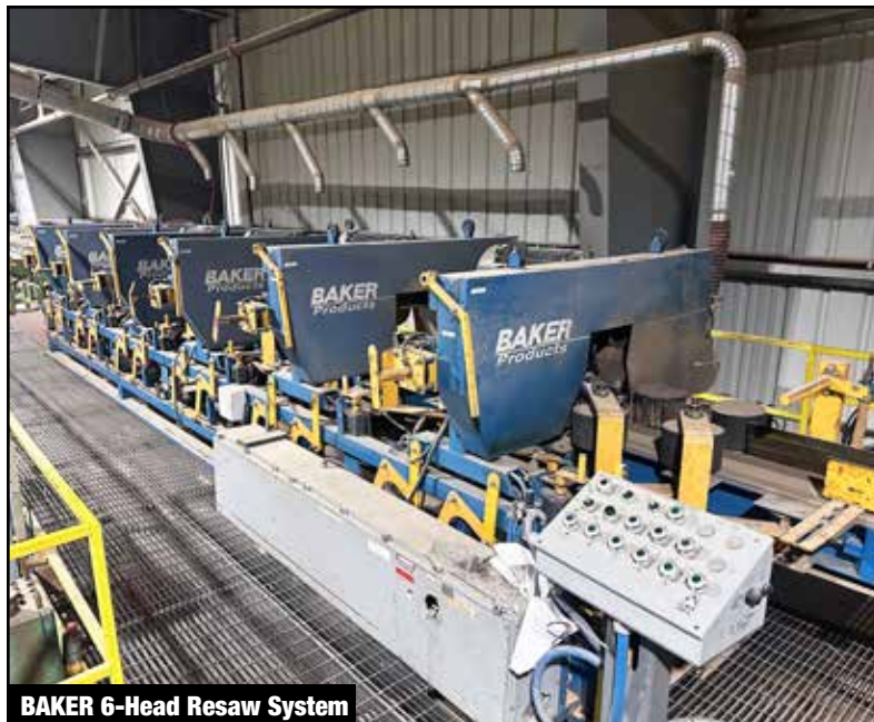
BAKER 6-Head Resaw System

Maynards Industries Canada Ltd. SINCE 1902 AUCTIONS | LIQUIDATIONS | APPRAISALS