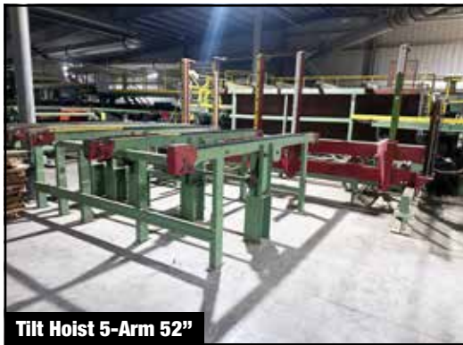
Tilt Hoist 5-Arm 52'