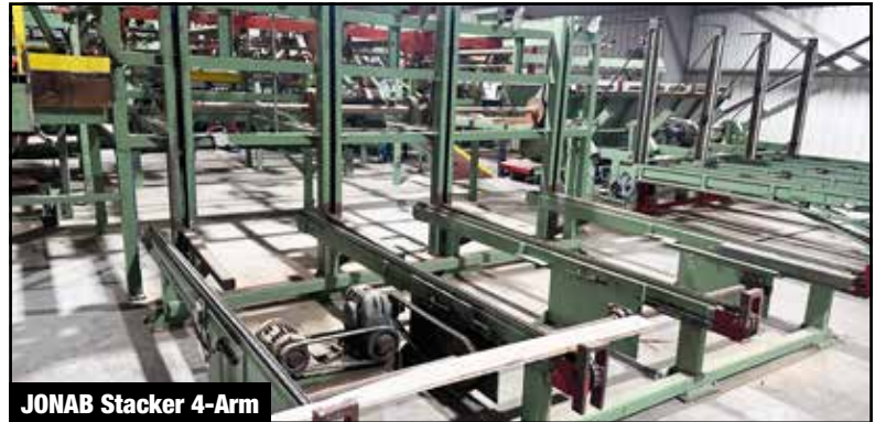
JONAB Stacker 4-Arm