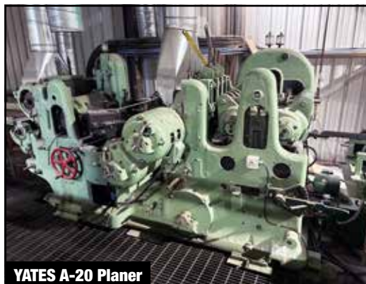
YATES A-20 Planer