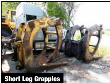
Short Log Grapples