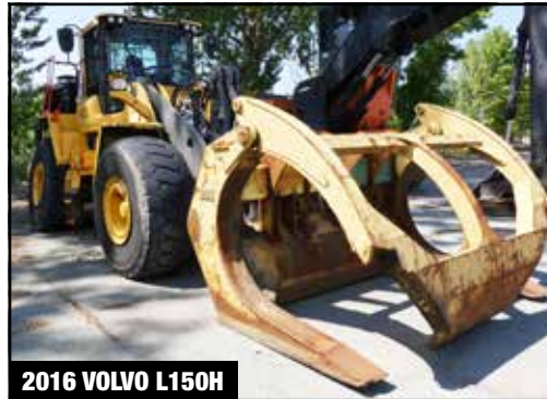
2016 VOLVO L150H