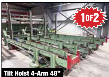
Tilt Hoist 4-Arm 48"