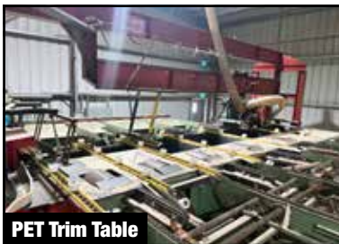
PET Trim Table