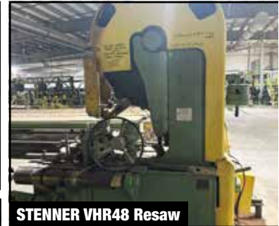
STENNER VHR48 Resaw