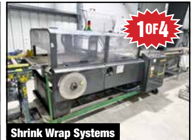
Shrink Wrap Systems