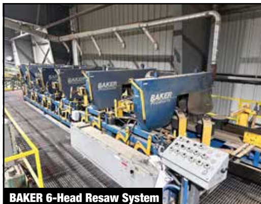
BAKER 6-Head Resaw System