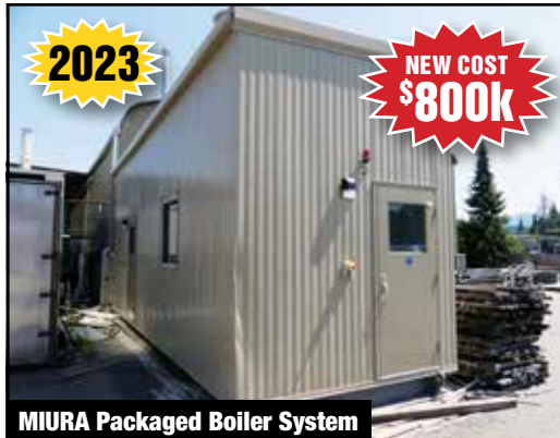
MIURA Packaged Boiler System