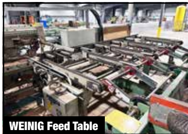
WEINIG Feed Table