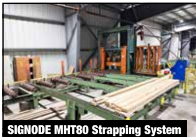
SIGNODE MHT80 Strapping System