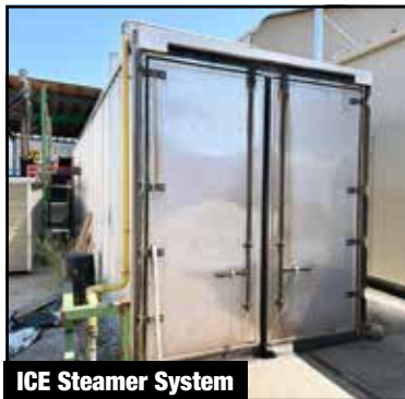
ICE Steamer System