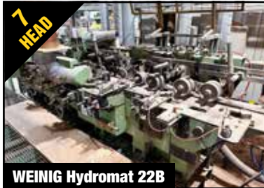
WEINIG Hydromat 22B