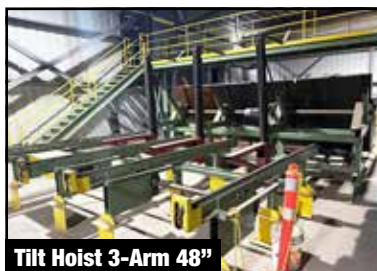
Tilt Hoist 3-Arm 48"