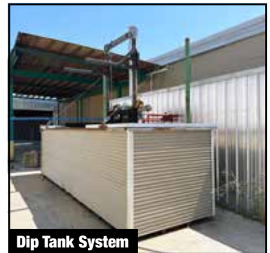
Dip Tank System