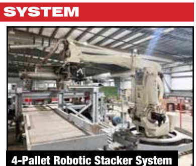
4-Pallet Robotic Stacker System