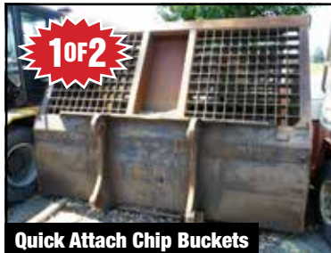
Quick Attach Chip Buckets