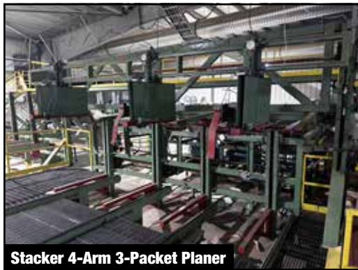
Stacker 4-Arm 3-Packet Planer