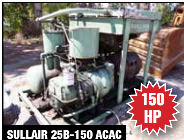
SULLAIR 25B-150 ACAC