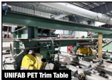
UNIFAB PET Trim Table