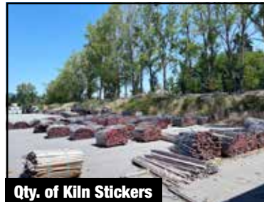
Qty. of Kiln Stickers