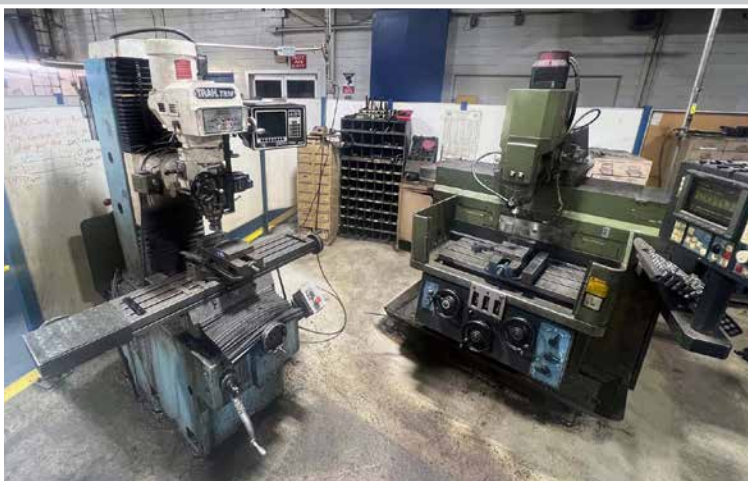
TRAK & MAKINO CNC Milling Machines