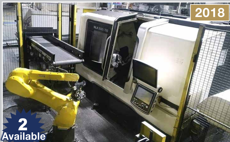
DMG Mori NLX3000-700 CNC Turning Center