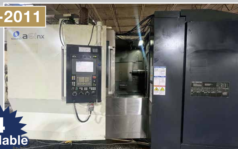
MAKINO a61nx Horizontal Machining Center