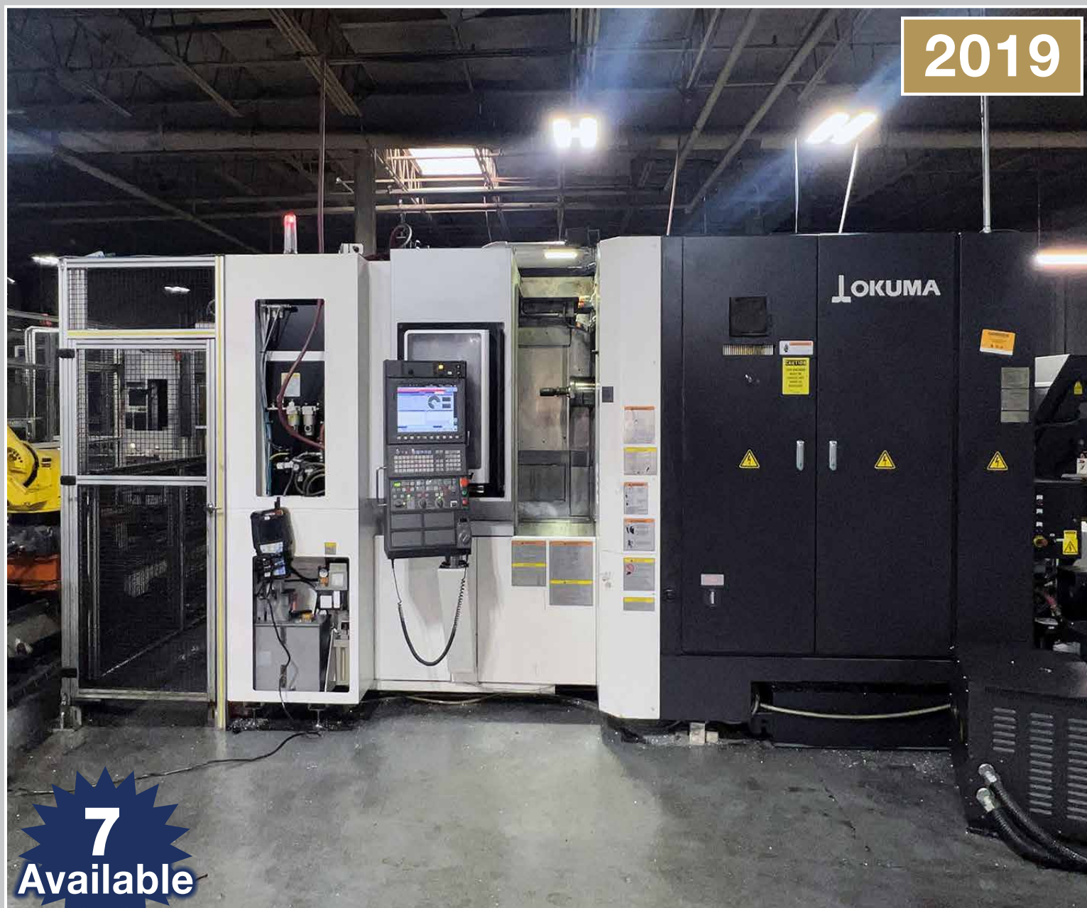
OKUMA MB 4000H Horizontal Machining Center

For Further Information Email: customerservice@maynards.com