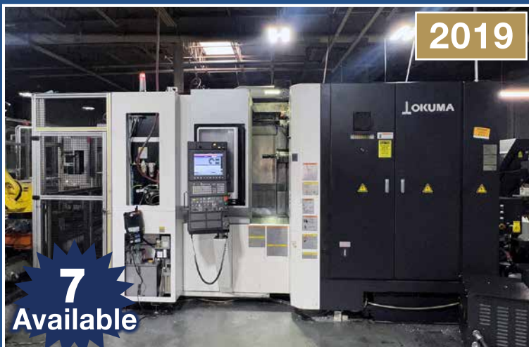
OKUMA MB 4000H Horizontal Machining Center