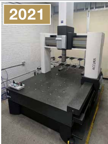
ZEISS Accura 9/16/8

For Further Information Email: customerservice@maynards.com