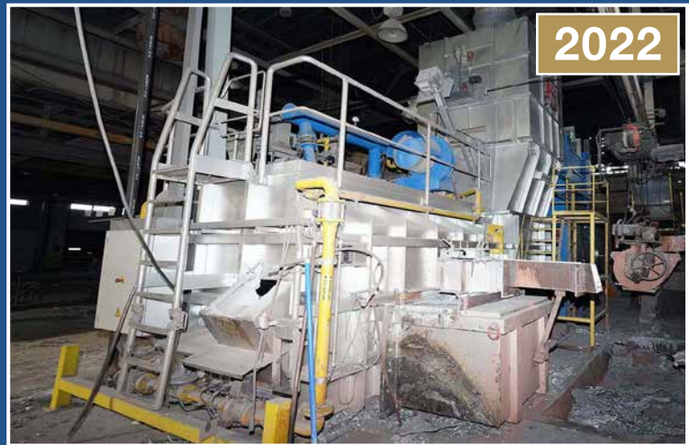
STRIKO Westofen MH 6000-3000 Aluminum Melt-Hold Furnace