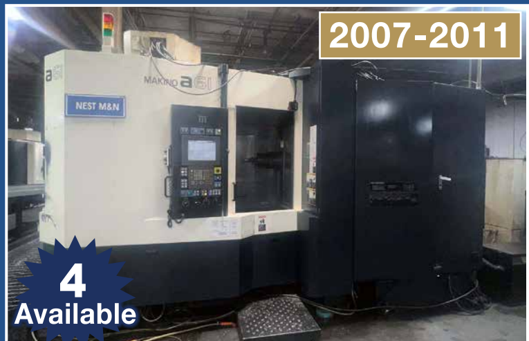
MAKINO Horizontal Machining Center