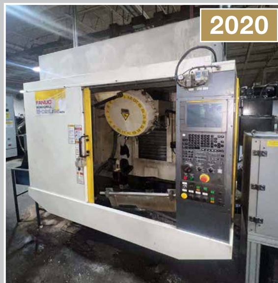
ROBODRILL CNC VMC