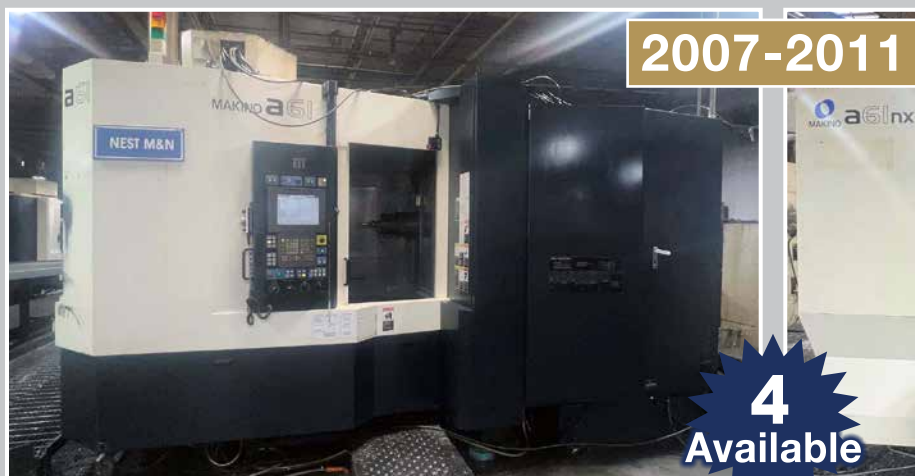
MAKINO a61 Horizontal Machining Center