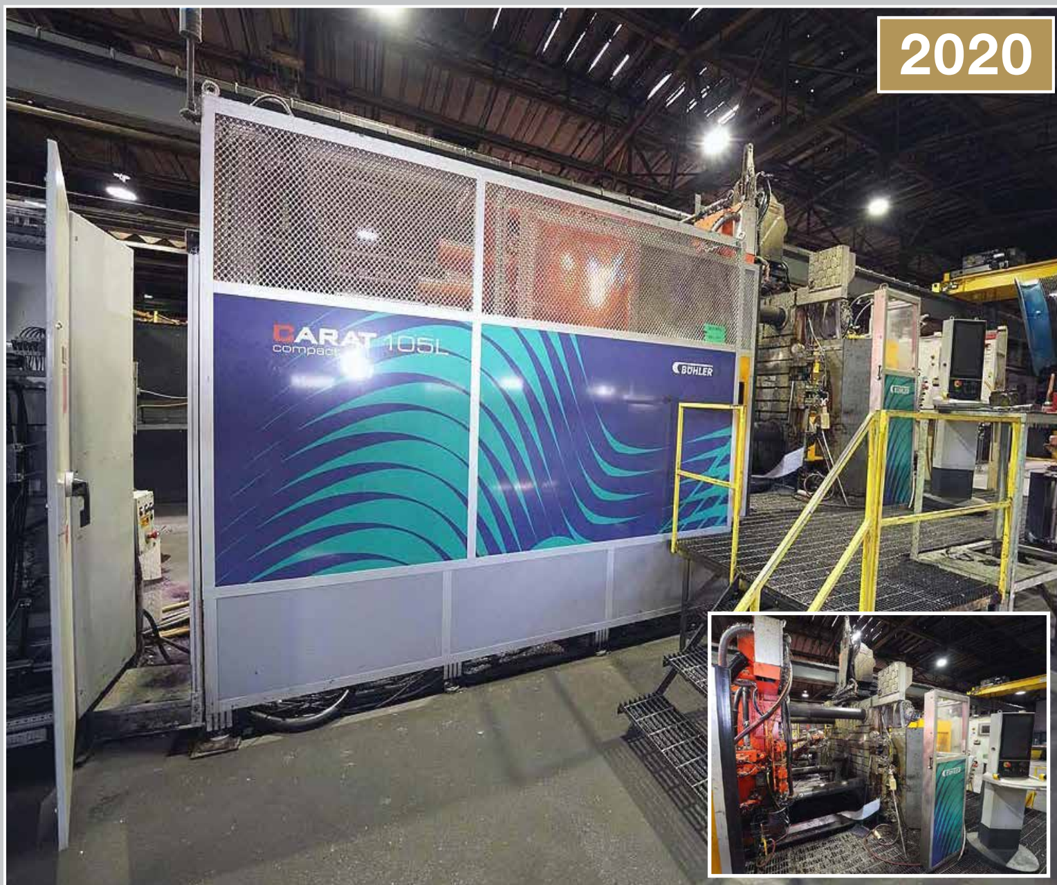
BUHLER Carat105L Compact Series Die Cast Press

For Further Information Email: customerservice@maynards.com