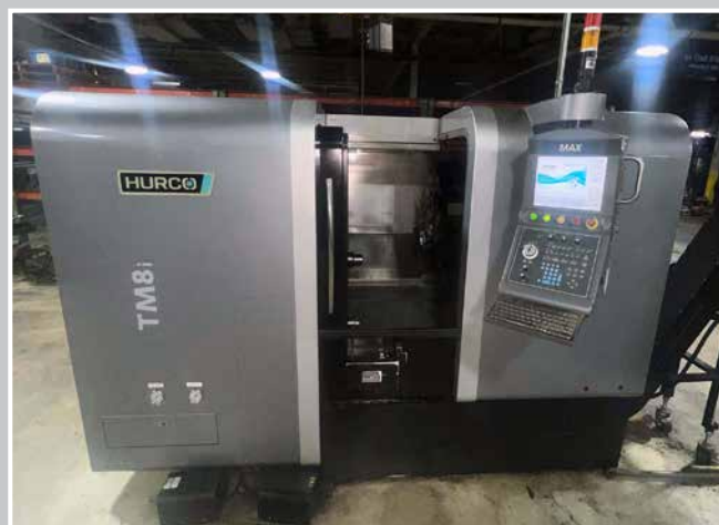
HURCO TM8i CNC Turning Center