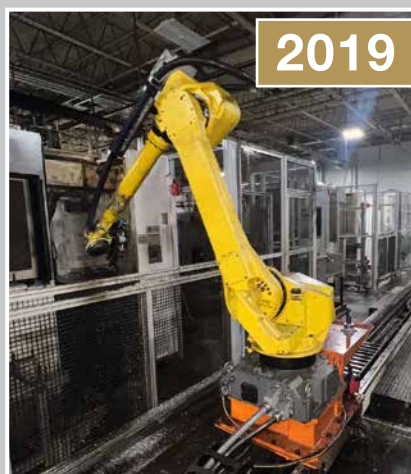
FANUC M-710iC 7-Axis Robots