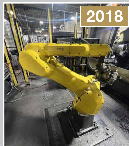
FANUC M-20iB Robot