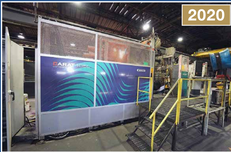
BUHLER Carat105L Compact Series Die Cast Press

FEATURING: Die Cast Machines, Melt Furnace & Support Equipment • CNC Machining & Turning & Robots • Inspection & Lab Equipment • In-Line Washers • Tool Room Equipment Rolling Stock / Cranes / Plant Utilities • Large Quantity Spare Parts & MRO