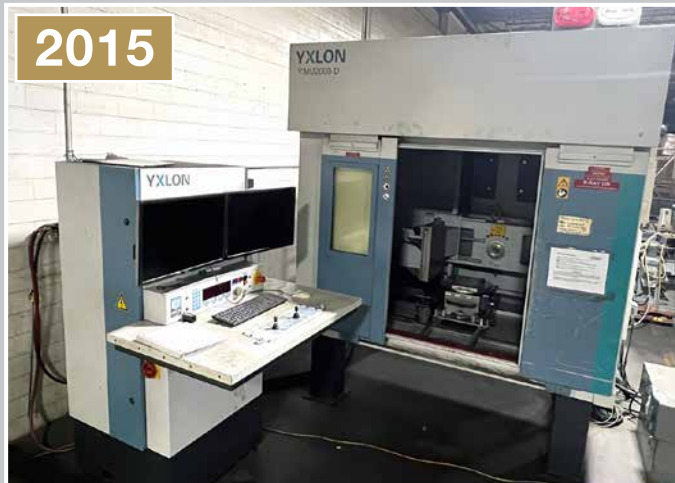
YXLON X-Ray Machine