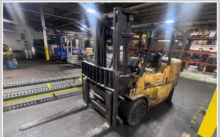
CAT Model GC70K LP Forklift, 15,000 Lb. Cap.