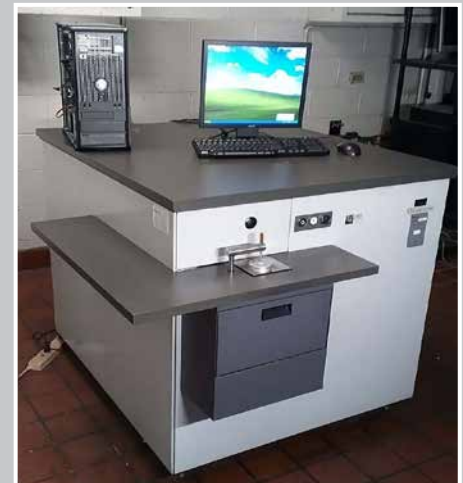
BRUKER-MAGELLAN Q8 Spectrometer