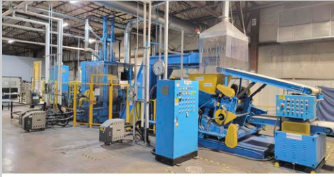
MXI 50 Liter Mixing Line