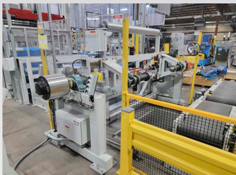
Menzel Two-Position Turret Let-Off