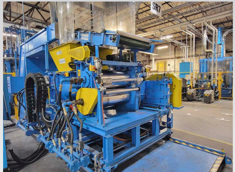
MXI 50 Liter Mixing Line