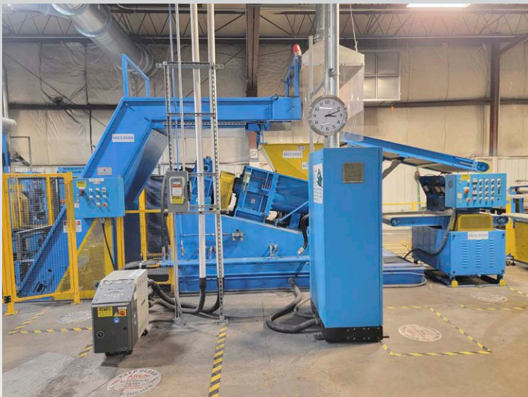
MXI 50 Liter Mixing Line