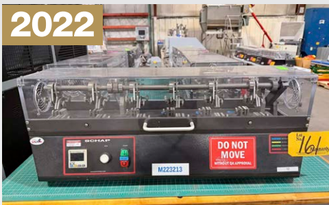
2022 Schap 12-Station Bally Tester

(20) Schap & Unuo Instruments 12-Station Bally Testers