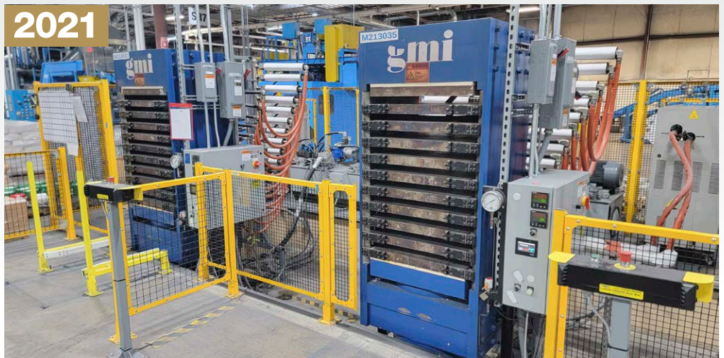
2021 GMI 450 Ton Upacting Hydraulic Presses

Hofer HKP 500 Ton Laminating Press, Max Panel Size 4' x 8'