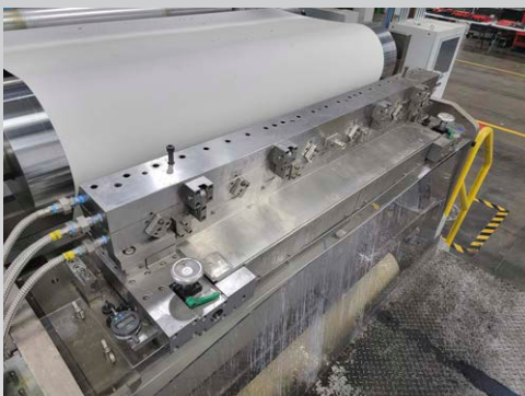
Coating Tech Slot Die