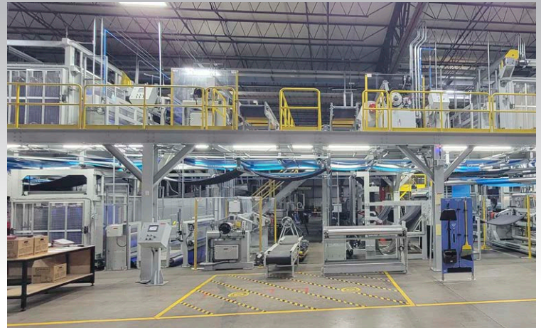
Menzel 73 In - 62 In Entry Line

TERMS AND CONDITIONS | PAYMENT: Full payment within 48 hours of receiving invoice. Wire Transfer, Cashier's Check or Certified Check. No other forms of payments will be accepted. Removal dates for each sale will be posted on www.maynards.com . Full Payment Must be Made before removal of Purchase. Everything is Sold "As-Is, Where-Is." All Sales Final. Cost and Responsibility for Removal of Purchase Remains with the Purchaser. Every Effort will be Made to Facilitate Removal. While Quantities and Descriptions are Believed to be Accurate, the Auctioneer, Owners or Counsel Make no Warranties or Guarantees Either Expressed or Implied as to Authenticity, Genuineness of or Defects in Any Lot & will not be Held Responsible for any Advertising Discrepancies or Inaccuracies. No Warranties Whatsoever are Made as to Condition Merchantability or Fitness for Use of Any Item. We Suggest you Take Full Advantage of the Preview & Inspection Period. Sale Subject to Additions & Deletions. Sales Tax 6% unless exemption forms are supplied. Please Check Availability of Equipment.