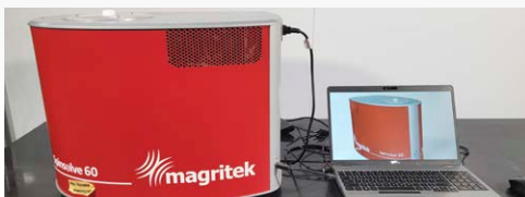
Magritek Spinsolve 60 Spectrometer