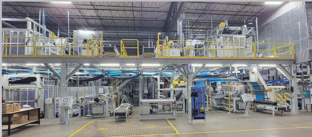
Menzel 73 In - 62 In Entry Line