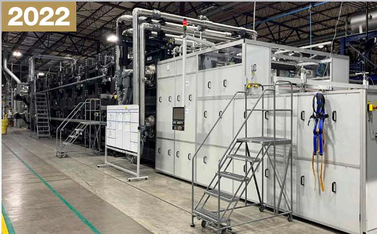
2022 IPCO CombiPress CB 1800 / Double Belt Press

17177 N. Laurel Park Drive Suite 236 Livonia, MI 48152