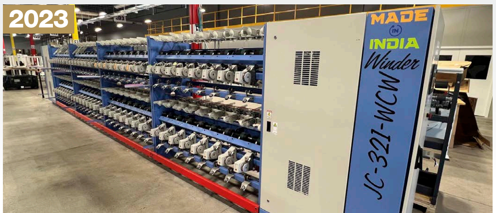
JCI #TS008 Series High Speed Winding Machines