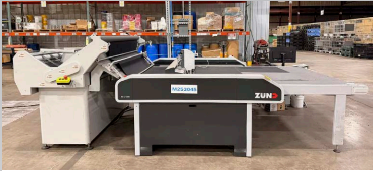
Zund S3 L-1200 Digital Cutter

2022 - Eastman Cloth Cutter, Blue Jay End Cutting System, Power Cradle #CRA-395-1039, Cardinal #548-SS-0017 Round Knife Mach, Zund Cut Center, Pre Cut Center Pro