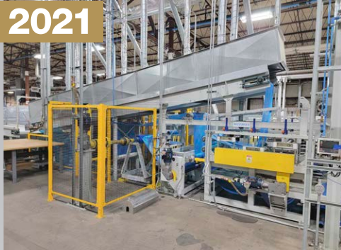
Menzel 36 In. Kiss Coating Line