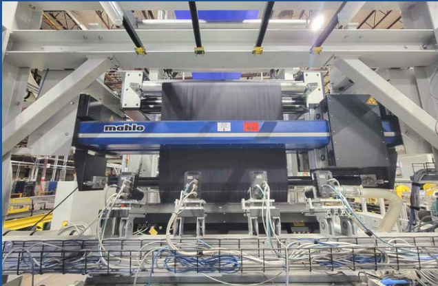
ISRA Surface Vision SMASH Advanced Inspection System

Surplus equipment no longer required in the continued operations of Natural Fiber Welding, Inc. COATING AND CONVERTING LINES, WINDING SYSTEMS, PRESSES AND ADVANCED LAB EQUIPMENT