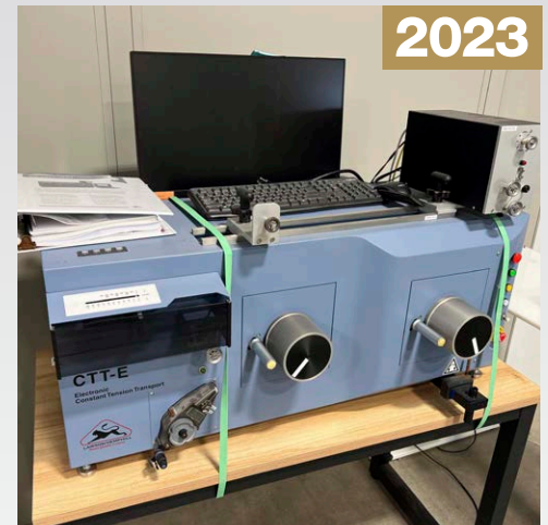
Lawson-Hemphill #LH-450 CTT-E Electronic Constant Tension Transp