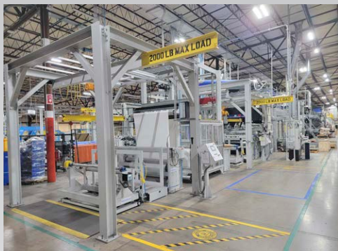
Menzel 73 In - 62 In Entry Line