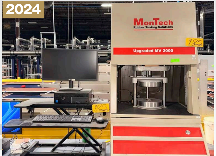
2024 Mon-Tech Upgraded MV2000 Rubber Testing Solutions Analyzer