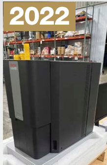
2022 Phenom XL G2 Desktop Scanning Electron Microscope