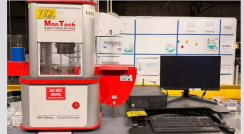
Mon-Tech Upgraded MDR3000 Basic Linear 5 Rubber Testing Solutions Moving Die Rheometer