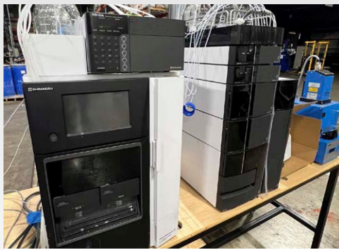
Shimadzu Prominence-I High Performance LT Plus Liquid Chromatography System