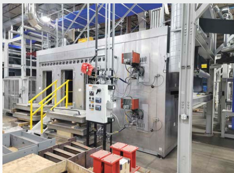
MAHAN Oven & Engr. Co. Single Pass Curing Oven