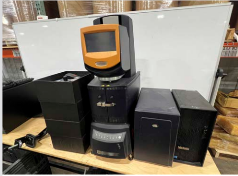
TA Instruments #TA HR20 Discovery Series Hybrid Rheometer

Memmert Typ HPP750 eco Constant Climate Chamber; QUV Accelerated Weathering Tester