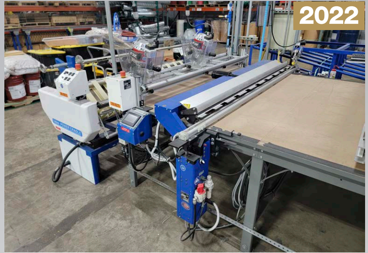
2022 Eastman Fabric Cutting Line