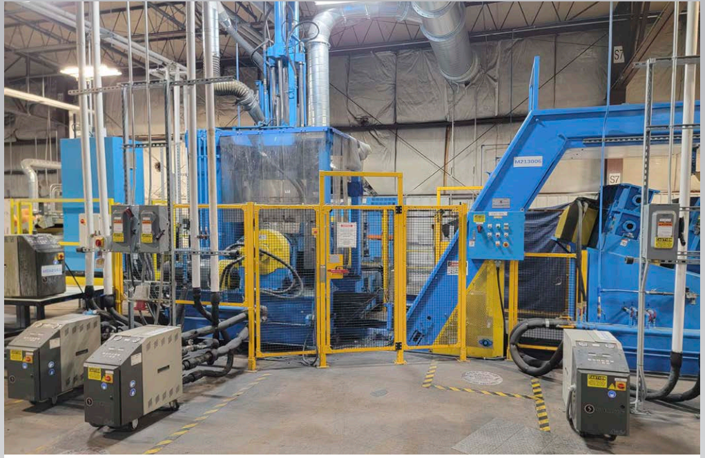
MXI 50 Liter Mixing Line