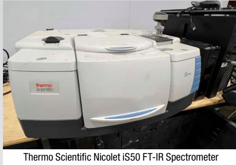
Thermo Scientific Nicolet iS50 FT-IR Spectrometer