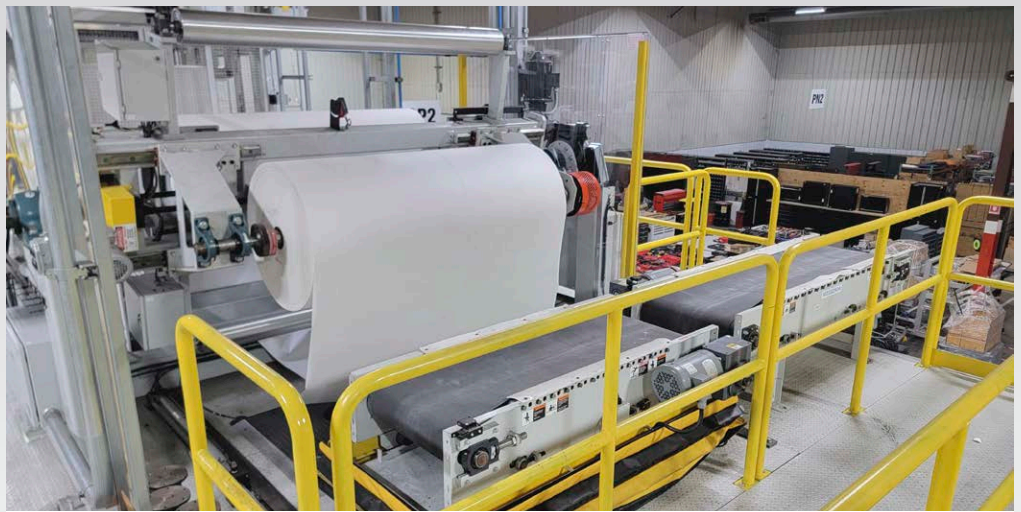
Paper Let-Off Station

(3) 2023 - Jiangsu Tangshi Textile Machinery Group #TS008 Series High Speed (Soft/Hard) Winding Machines, Max Speed 1000 m/min, 128 Stations; (2) Unused