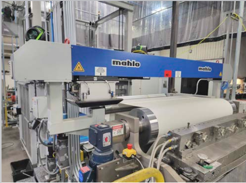
Mahlo Beta Gauge