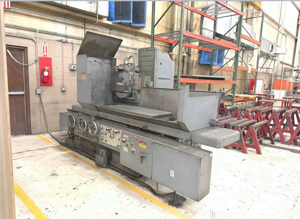
Okamoto PSG-125 Hydraulic Surface Grinder

Large Quantity of Tool Holders, Angle Plates, Tool Room, Welders, Inspection, Hand Tools, Power Tools, Benches, Transformers, Floor Scrubbers, Forklifts, Air Compressors, and much more