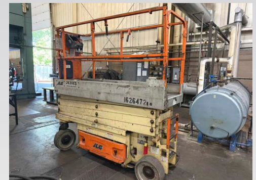
JLG 2630ES Scissors Lift