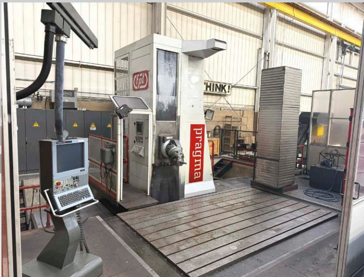
FPT Pragma M CNC Traveling Column Horizontal Milling Machine

1995 Anayak HVM 3300 Horizontal Milling Machine