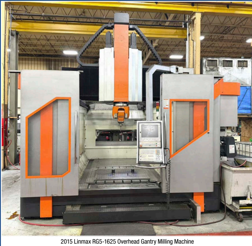
2015 Linmax RG5-1625 Overhead Gantry Milling Machine

Complete Contents from a Manufacturer that Specialized in the Custom Design and Production of Medium-to-Large Compression Molds, Plastic Injection Molds, Carbon Fiber Molds, and Die Cast Dies