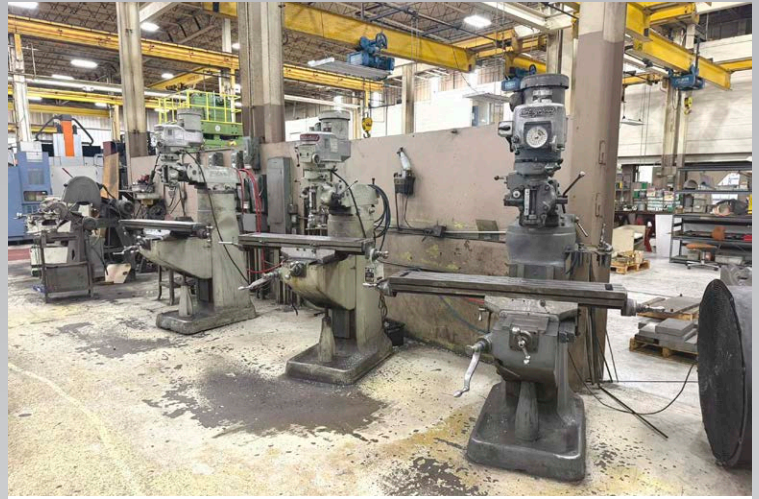
Bridgeport Vertical Milling Machines