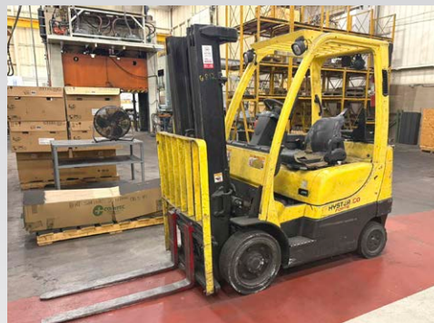
Hyster S-50FT Forklift