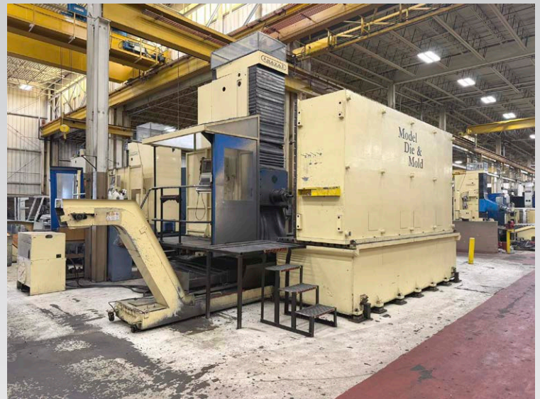
Anayak HVM-H-5000 CNC Traveling Column Horizontal Milling Machine