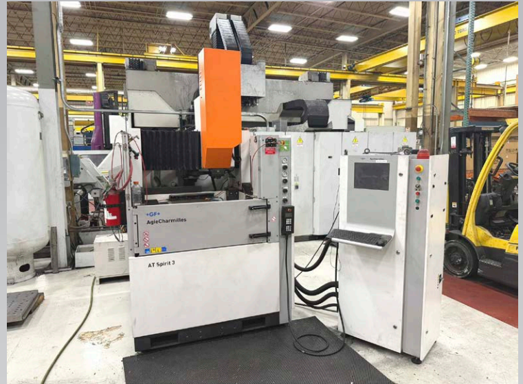
Agie Charmilles Agietron Spirit 3 C-Axis CNC Sinker EDM

2016 Makino EDNC 15 Electrical Discharge Machine, 53" x 78.5" T-Slotted Table, (2) 39" x 47" Tooling Plates, 67" x 45" x 31" XYZ Travels, Erowa Chuck System, Hyper I Touch Screen Control, Drop Tank, 16-Position ATC, Hyper I Touch Screen Control