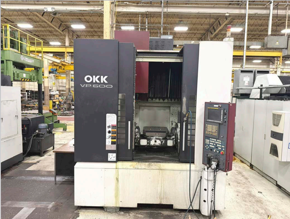
OKK VP600 CNC Vertical Machining Center