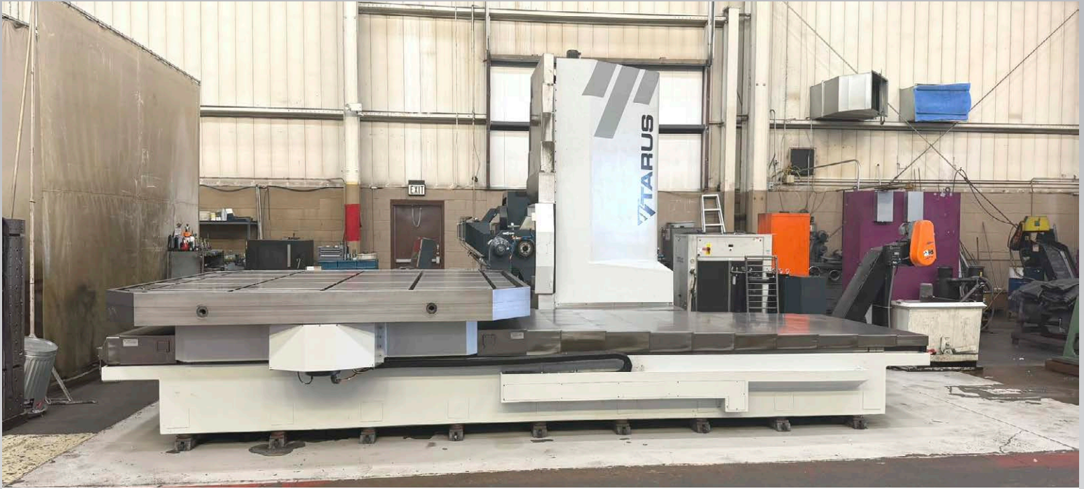
2017 Tarus GDTTC510-6XRT CNC Deephole Gun Drilling Machine