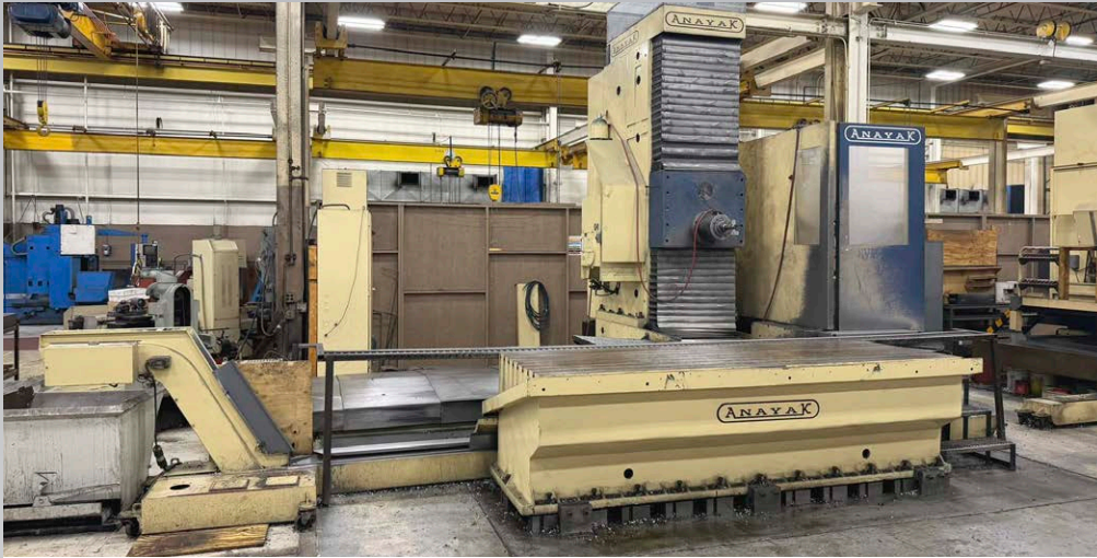
Anayak CNC Traveling Column Horizontal Milling Machine