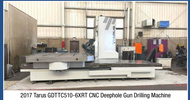
2017 Tarus GDTC510-6XRT CNC Deephole Gun Drilling Machine