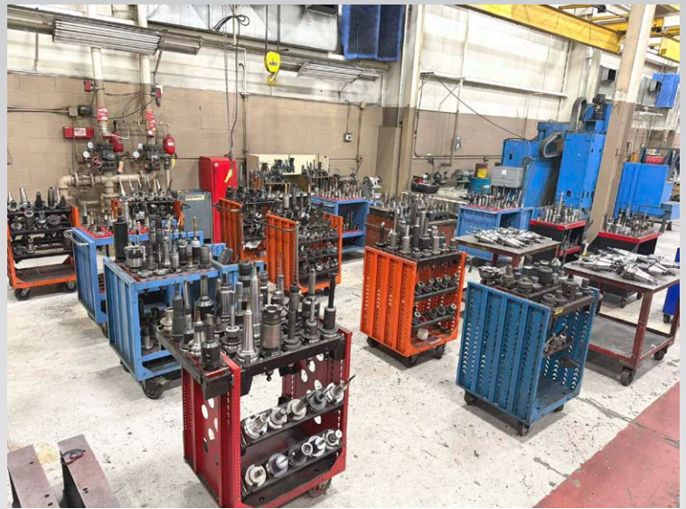
CNC Tool Holders