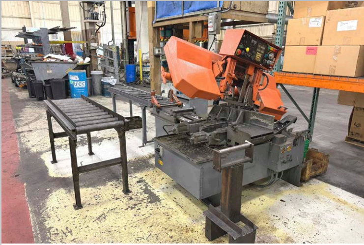
Amada HFA250W Horizontal Band Saw