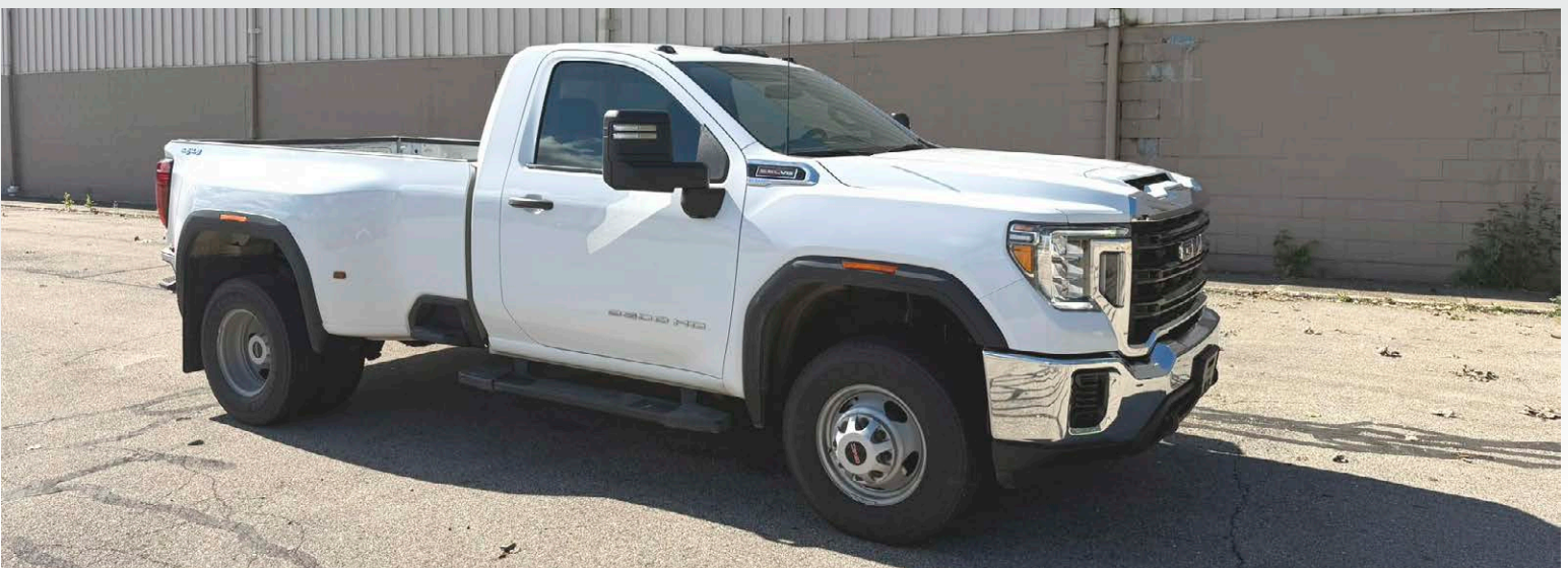
GMC 3500 HD Dually Pickup Truck