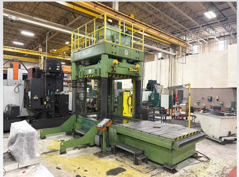
Millutensil MIL203 Hydraulic Spotting Press