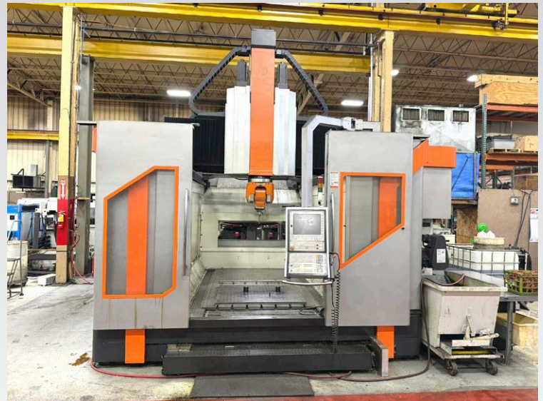
2015 Linmax RG5-1625 Overhead Gantry Milling Machine