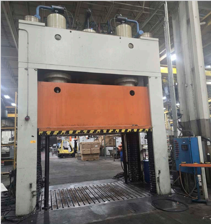
2000 HPT 2500 Ton Hydraulic Tryout Press

2007 Agie Charmilles Agietron Spirit 3 C-Axis CNC Sinker EDM, 19.75" x 27.5" T-Slotted Table, Drop Tank, 12.7" x 15.7" x 13.8" XYZ Travels, 10-Position Electrode Holder, GF Touch Screen Control, Erowa System