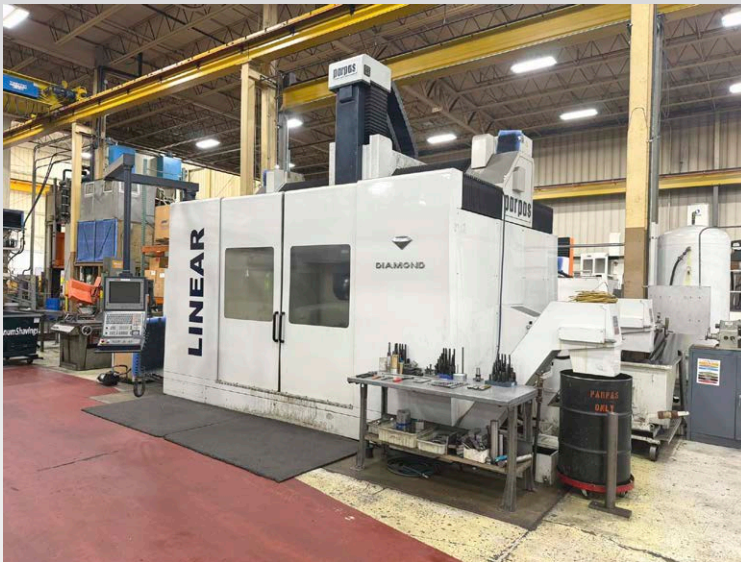
Parpas Diamond 30 Linear CNC Gantry Mill