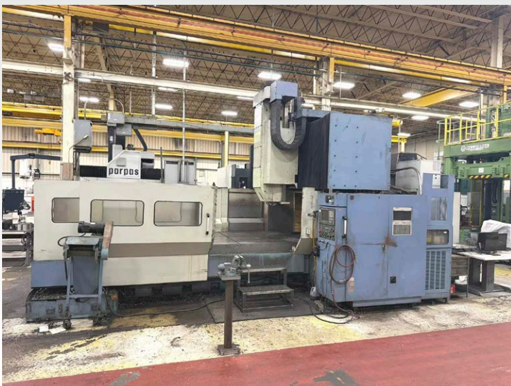
2003 Sogotec BD3223 CNC Bridge Mill