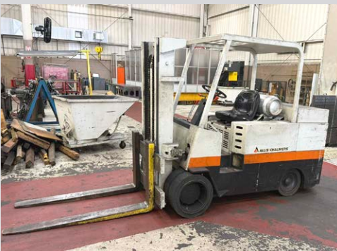
Allis Chalmers 12,000 Lb Capacity Forklift