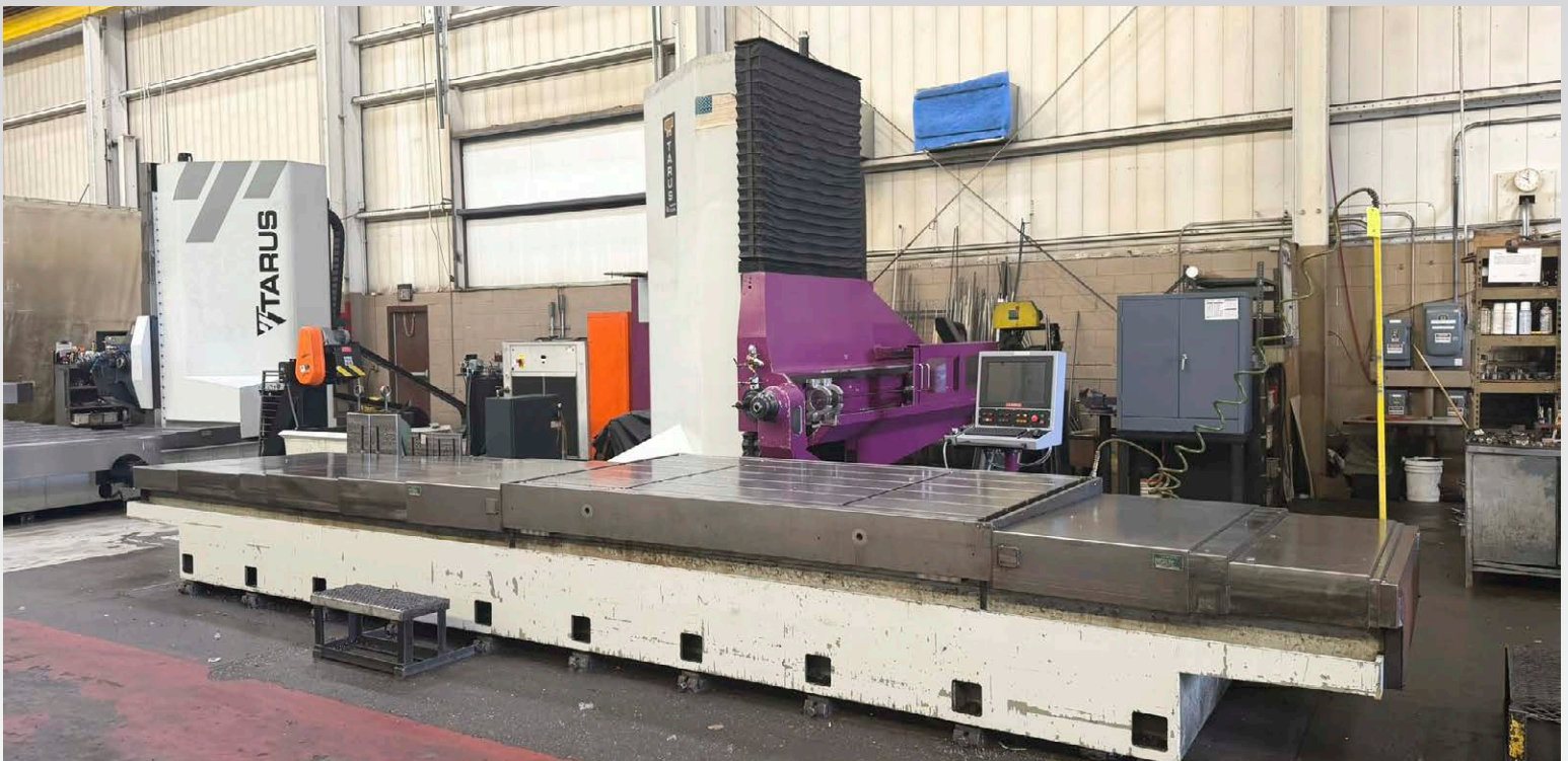
Tarus CNC Gun Drill