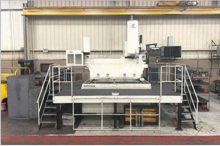
2016 Makino EDNC 15 EDM