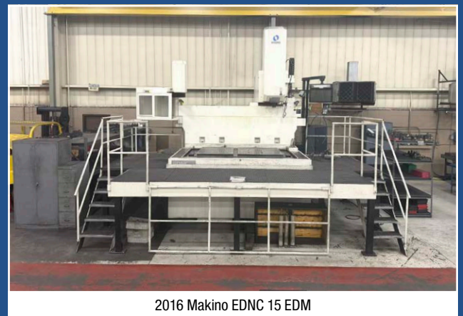
2016 Makino EDNC 15 EDM

Featuring 5-Axis CNC Machining Capabilities, CNC Gantry Mills, CNC Gun Drills, EDMs, Tryout & Spotting Presses, CNC Horizontal Milling Machines, CNC Bridge Mills, CNC Vertical Machining Centers, and Additional Equipment