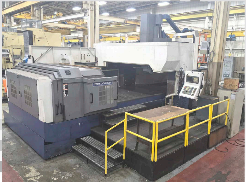
YCM Industries DCV4025B Bridge Type Vertical Machining Center