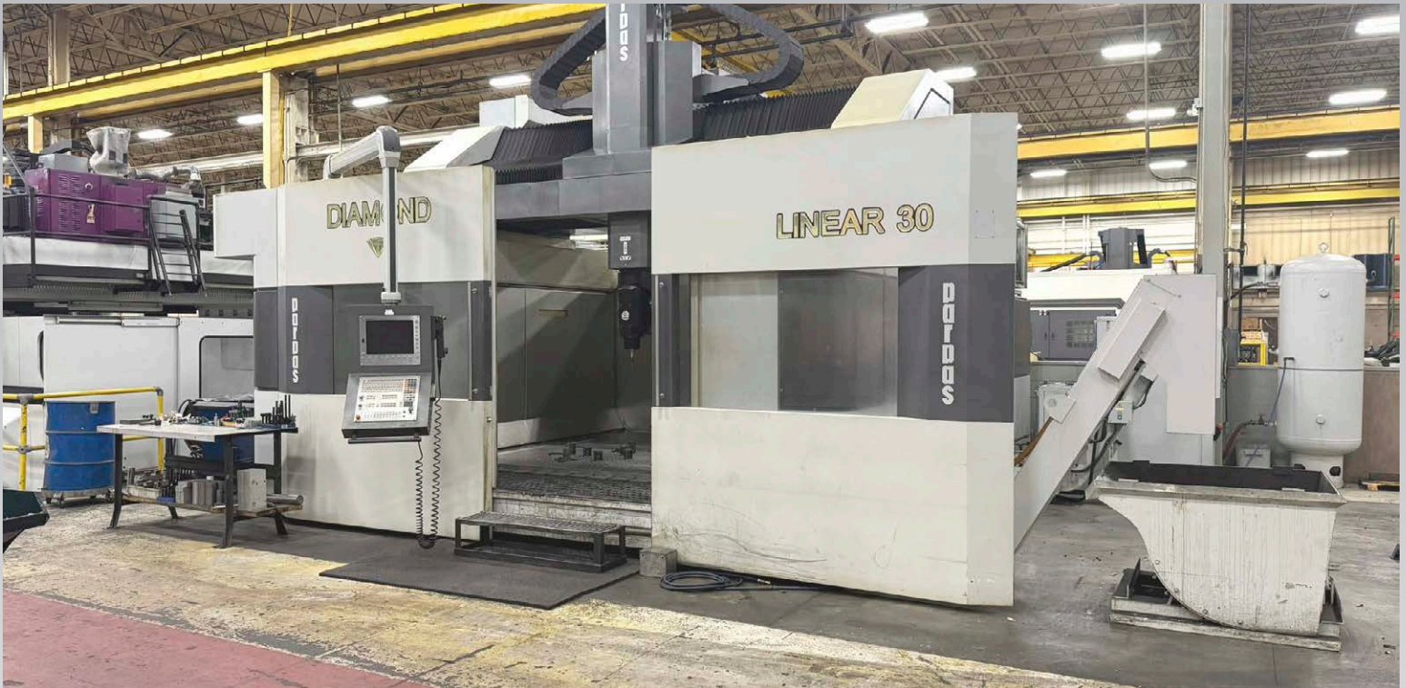
Parpas Diamond 30 Linear CNC Gantry Mill