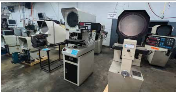
Partial View of Optical Comparators