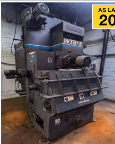
Wheelabrator Rubber Belt Tumblasts