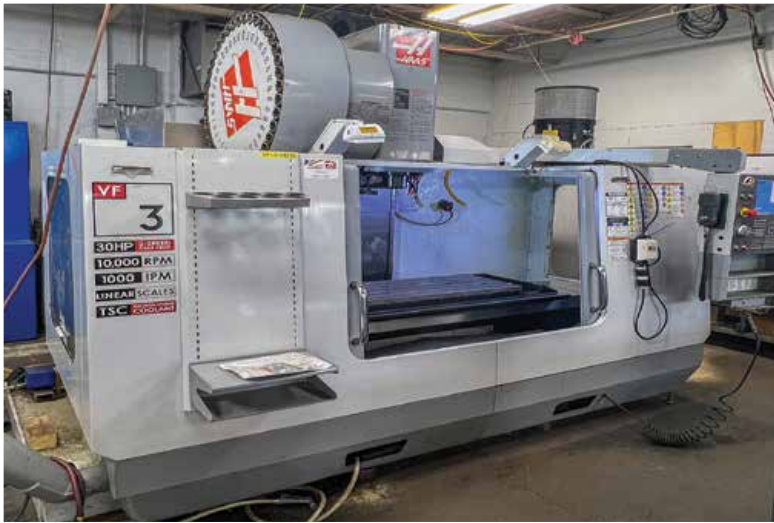
HAAS VF3 3-Axis CNC Vertical Machining Center