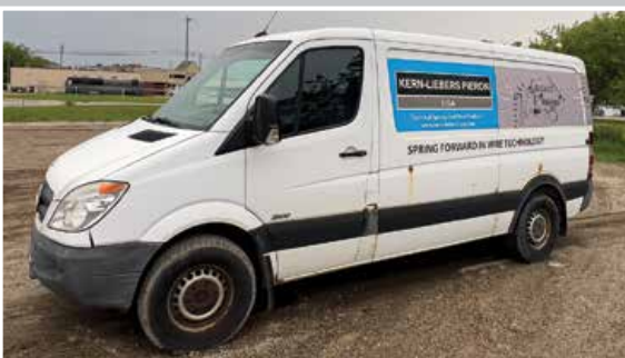
MERCEDES 2500 Sprinter Cargo Van