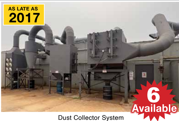
Dust Collector System