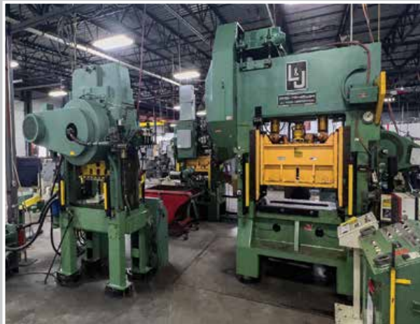
75-Ton L&J High Speed Press