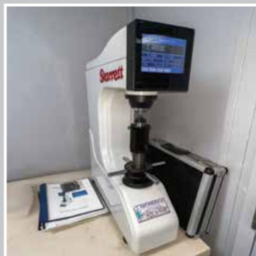
STARRETT Hardness Tester