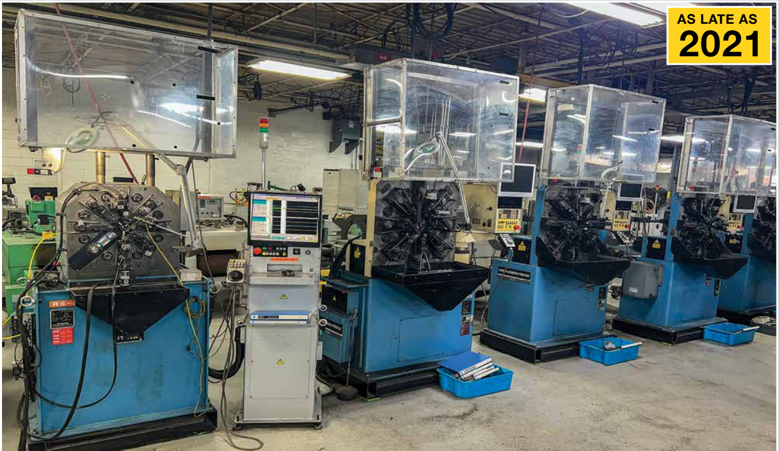
ITAYA Multislide Wire Forming Machines

INSPECTION: Monday, July 7, 9am to 4pm ET • ASSET LOCATION: 2700 Wickham Dr., Muskegon, MI