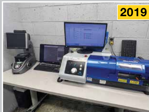
MICROSTUDIO PTZ2 Spring Tester