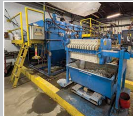
JWI Filter Press