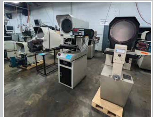
Partial View of Optical Comparators

TERMS & CONDITIONS | PAYMENT: Full payment within 24 hours. Payment is Cash, Cashier's check, Certified Check or Wire Transfer. No other forms of payments will be accepted. Full Payment Must be Made before removal of Purchase. Everything is Sold "As-Is, Where-Is". All Sales Final. Cost and Responsibility for Removal of Purchase Remains with the Purchaser. Every Effort will be Made to Facilitate Removal. While Qty. and Descriptions are Believed to be Accurate, the Auctioneer, Owners or Counsel Make no Warranties or Guarantees Either Expressed or Implied as to Authenticity, Genuineness or of Defects in Any Lot & will not be Held Responsible for any Advertising Discrepancies or Inaccuracies. No Warranties Whatsoever are Made as to Condition Merchantability or Fitness for Use of Any Item. May we Suggest you Take Full Advantage of the Preview and Inspection Period. Sale Subject to Additions and Deletions. Please Check Availability of Equipment. Last Date of Removal (No Exceptions) is Thursday, July 31st.