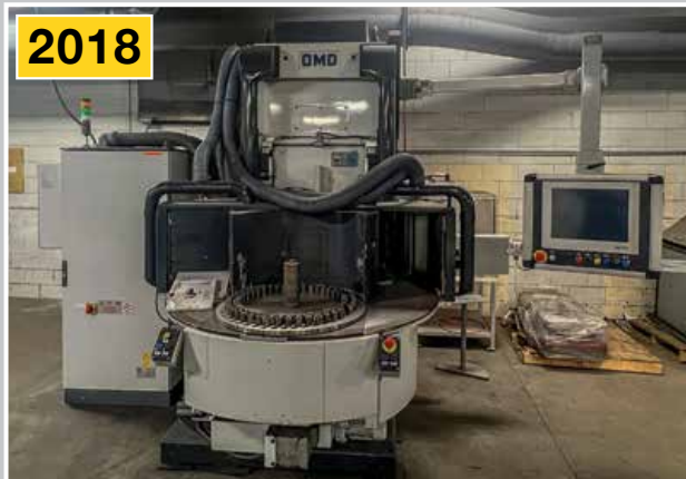
OMD MA10/2E-370 Spring End Grinding Machine