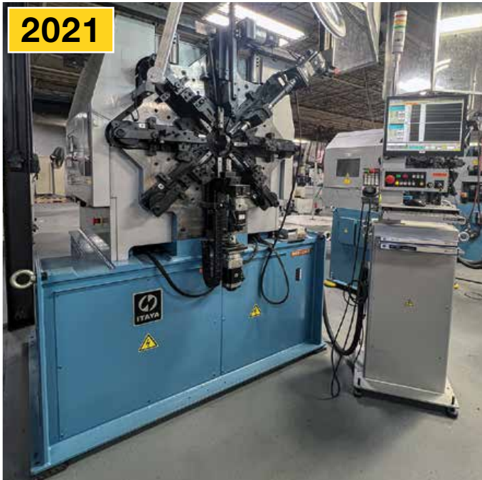
ITAYA MX-20B CNC Wire Forming/Torsion Machine