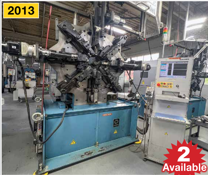
ITAYA MX-40A CNC Dual Point Simplex Coilers