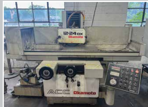
OKAMOTO ACC 12-24 DX Surface Grinder