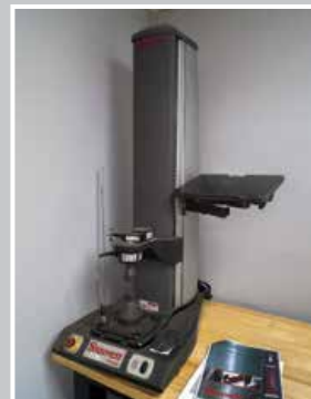
STARRETT Force Tester