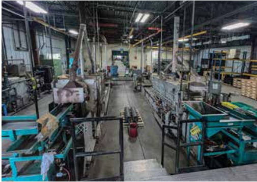
Heat Treat Lines