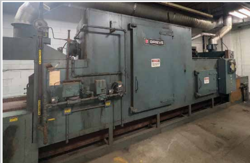
GRIEVE Heat Treat Line