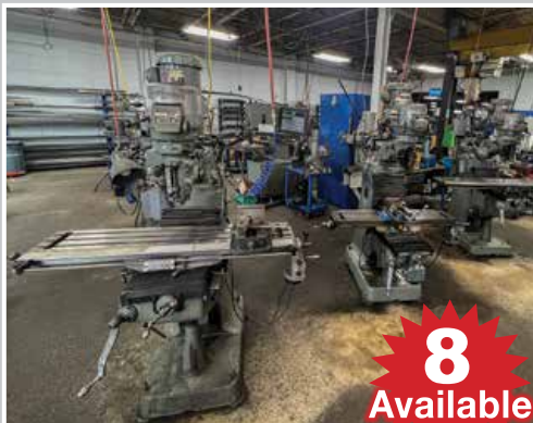
Partial View of BRIDGEPORT Mills