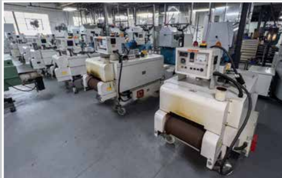
FORMING SYSTEMS CNC Port. Elect. Conveyor Furnaces