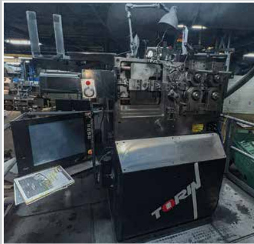
FENN TORIN Spring Coiler