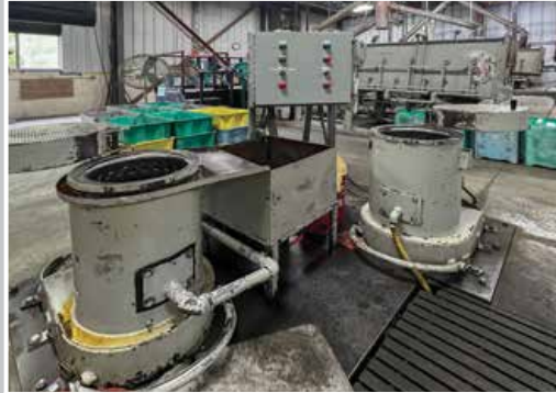
NEW HOLLAND Spin Dryer