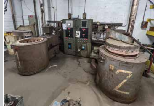
LINDBERG Heat Treat Furnaces