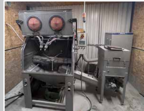
SIGG TR 110 DK Glass Blasting Cabinet