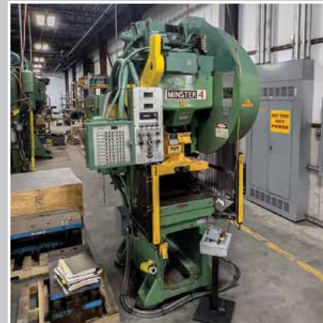
32-Ton MINSTER Gap Frame Press