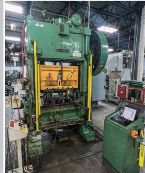
100-Ton MINSTER Piece-Maker Press