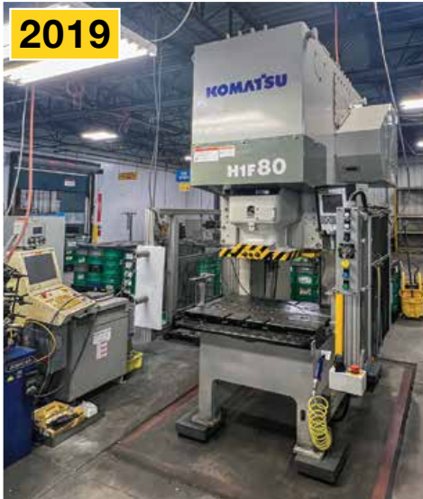
80-Ton KOMATSU Servo Press