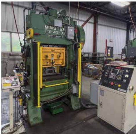
45-Ton MINSTER Piece-Maker Press