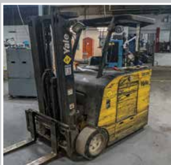
HYSTER S80XM LP Type Forklift