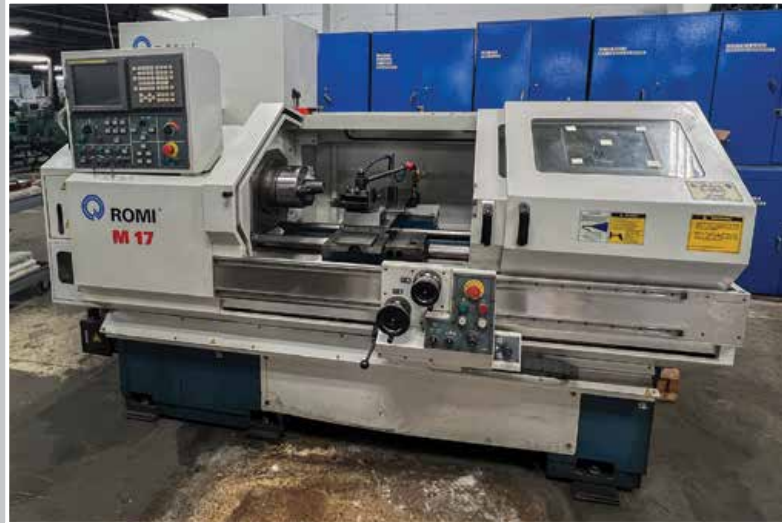
ROMI M17 CNC Lathe