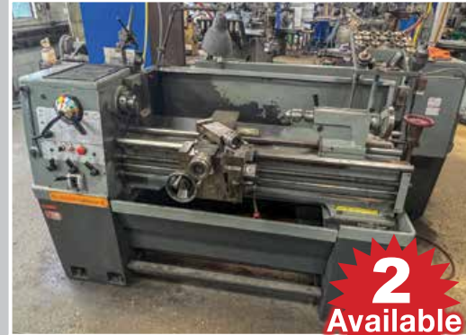
Clausing-Colchester Engine Lathe