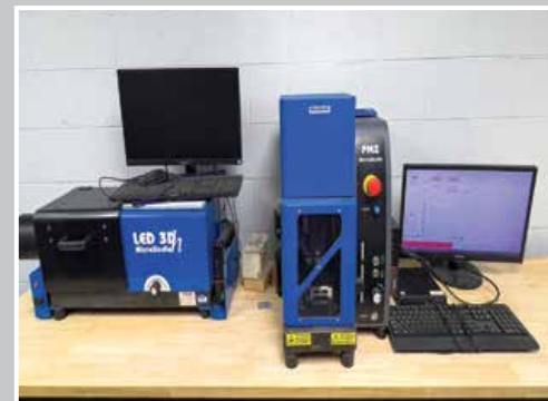
MICROSTUDIO LED3D-50H Spring Tester