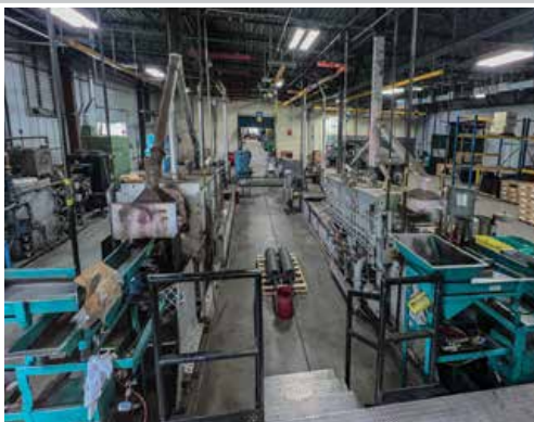
Heat Treat Lines

FEATURING: CNC Wire Coilers, CNC Wire Forming/Torsion Machines, High Speed Stamping Presses and Servo Feed Lines, Link Belt Conveyor Ovens – Late as 2017, Shot Blast Equipment, CNC Machinery, Spring Grinders, Custom Built Insertion/Visual Inspection Cells, Test & Inspection Equipment, Laboratory Equipment, Rolling Stock, Plant Facilities, Tool Room Equipment & Plant Support Equipment