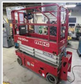
MEC 1930SE Scissors Lift

Place your bid now! Register at: BidSpotter