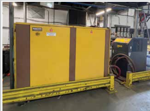
KAESER Air Compressor