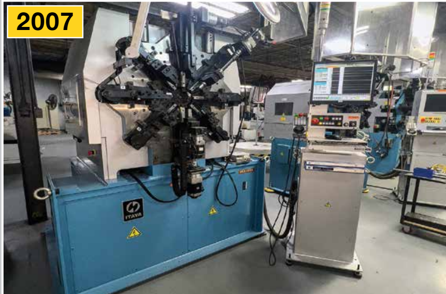
ITAYA MX-20A CNC Wire Forming/Torsion Machine