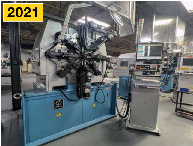
ITAYA MX-20B CNC Wire Forming/Torsion Machine

DAY 2 & 3 – Online: Ends July 9 & 10 @ 10am ET Each Day