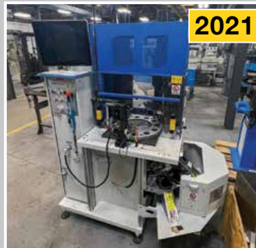
MICROSTUDIO Spring Tester