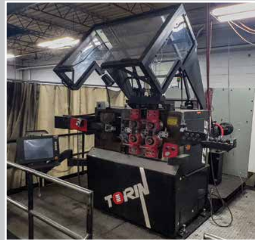
TORIN Wire Straightening & Forming Machine