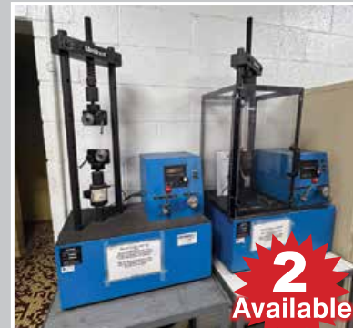
UNITED Tension Testers