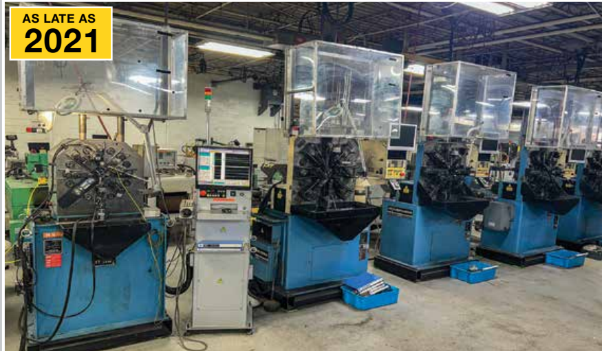
ITAYA Multislide Wire Forming Machines