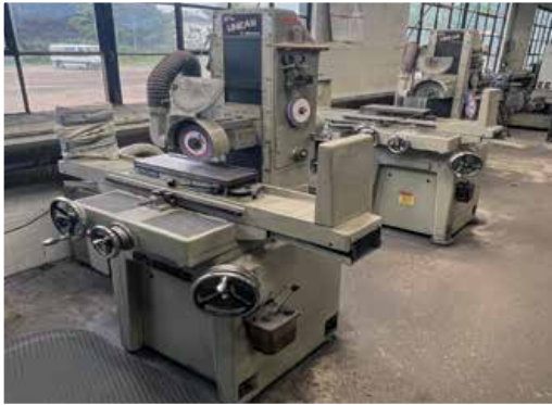
OKAMOTO 6-18 Surface Grinder