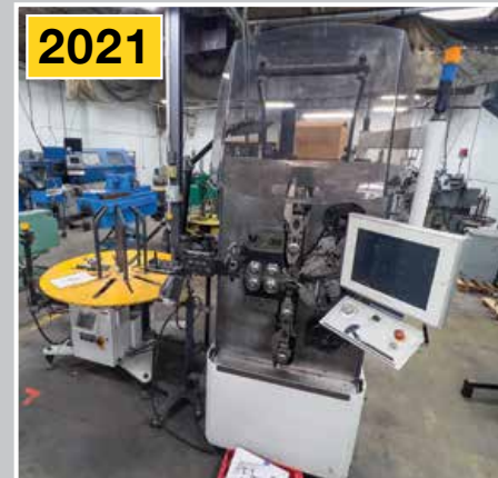
SIMPLEX Rapid ACF Spring Grinder