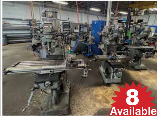
Partial View of BRIDGEPORT Mills