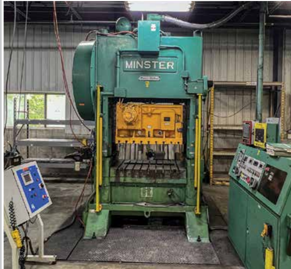
150-Ton MINSTER Piece-Maker Press