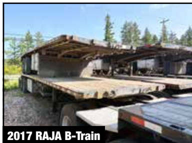
2017 RAJA B-Train