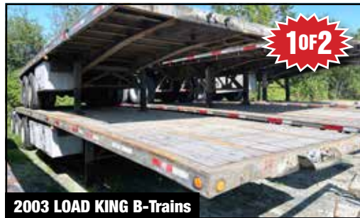
2003 LOAD KING B-Trains