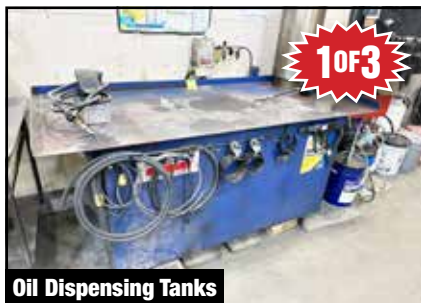
Oil Dispensing Tanks