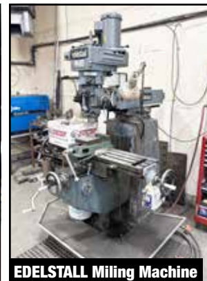
EDELSTAAL Milling Machine