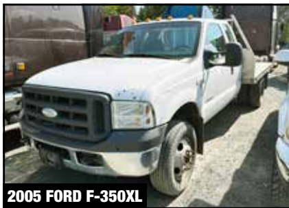
2005 FORD F-350XL