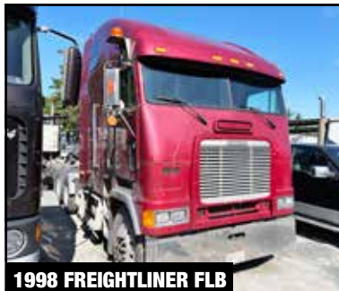
1998 FREIGHTLINER FLB