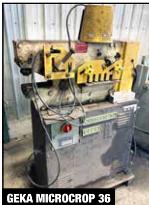
GEKA MICROCROP 36