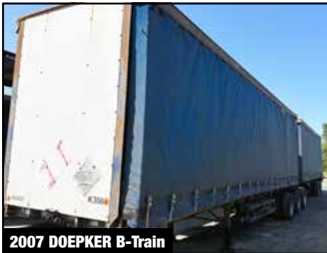
2007 DOEPKER B-Train