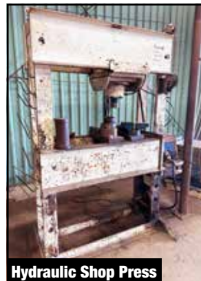
Hydraulic Shop Press