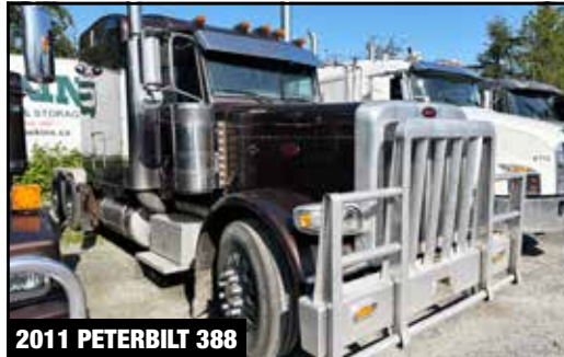
2011 PETERBILT 388