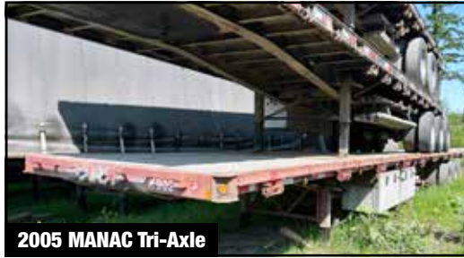
2005 MANAC Tri-Axle