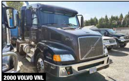
2000 VOLVO VNL