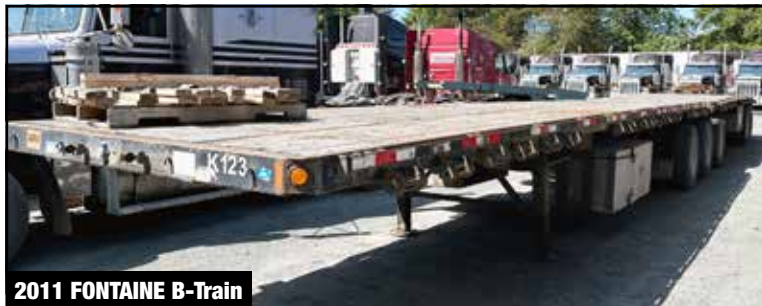
2011 FONTAINE B-Train