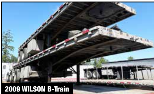
2009 WILSON B-Train