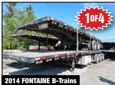
2014 FONTAINE B-Trains