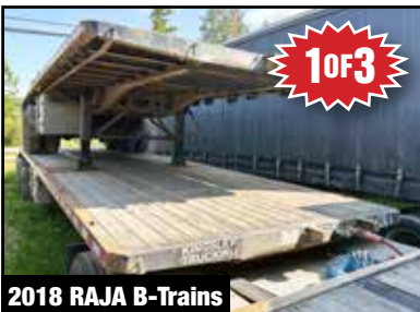
2018 RAJA B-Trains