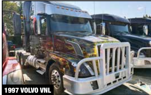
1997 VOLVO VNL