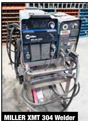
MILLER XMT 304 Welder