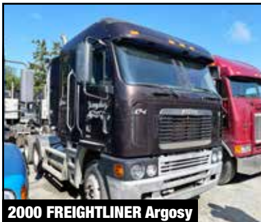
2000 FREIGHTLINER Argosy