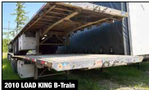
2010 LOAD KING B-Train