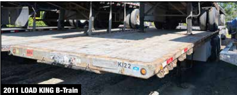
2011 LOAD KING B-Train