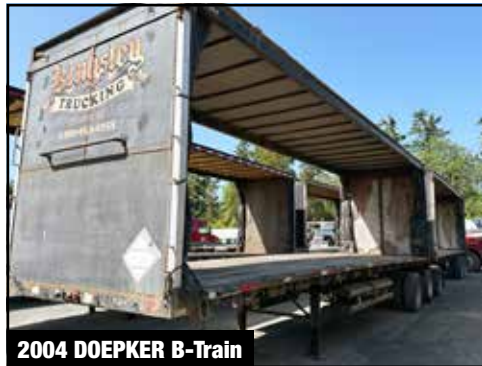
2004 DOEPKER B-Train