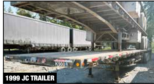
1999 JC TRAILER