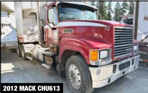
2012 MACK CHU613