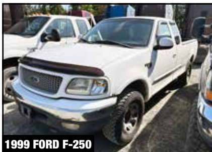
1999 FORD F-250