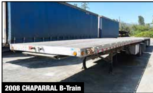
2008 CHAPARRAL B-Train