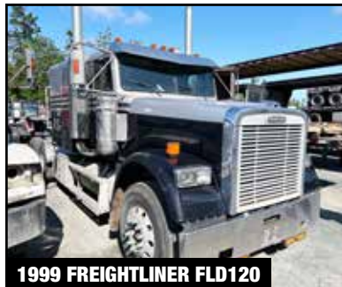
1999 FREIGHTLINER FLD120