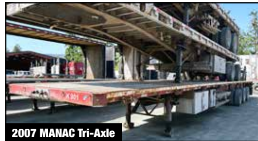
2007 MANAC Tri-Axle