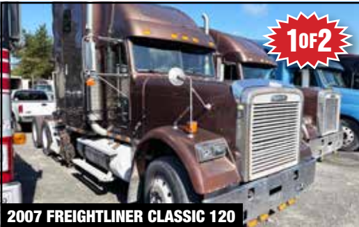
2007 FREIGHTLINER CLASSIC 120