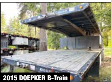
2015 DOEPKER B-Train