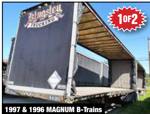
1997 & 1996 MAGNUM B-Trains