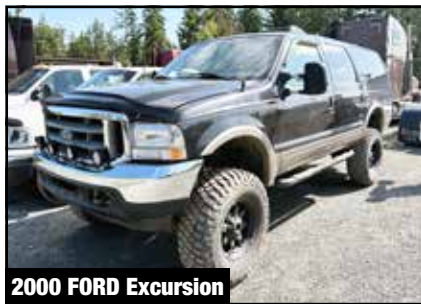
2000 FORD Excursion