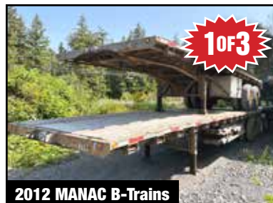
2012 MANAC B-Trains