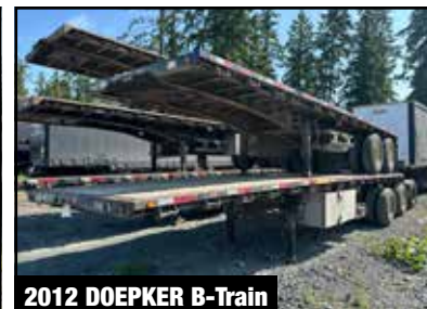
2012 DOEPKER B-Train