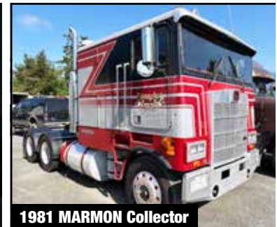
1981 MARMON Collector