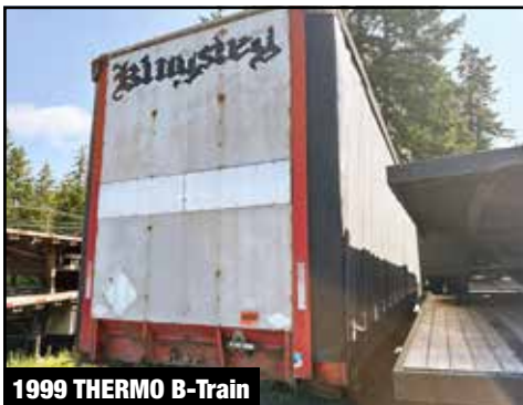
1999 THERMO B-Train