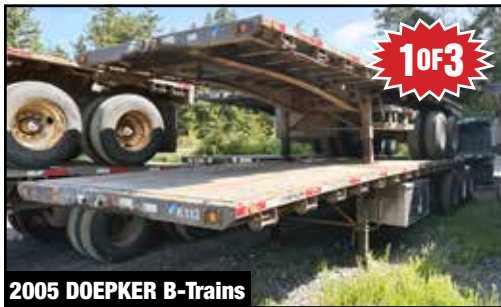
2005 DOEPKER B-Trains