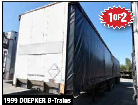
1999 DOEPKER B-Trains