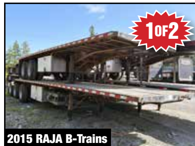
2015 RAJA B-Trains