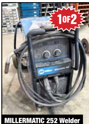
MILLERMATIC 252 Welder