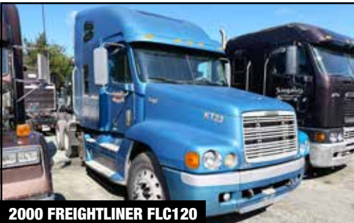
2000 FREIGHTLINER FLC120