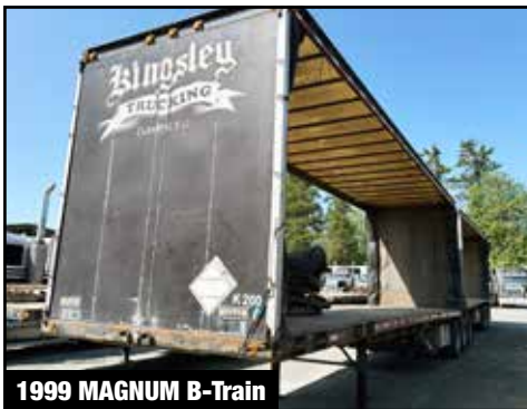
1999 MAGNUM B-Train