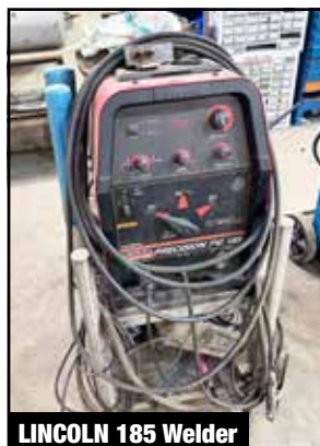
LINCOLN 185 Welder