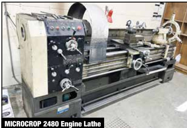
MICROCROP 2480 Engine Lathe