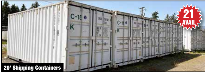
20' Shipping Containers