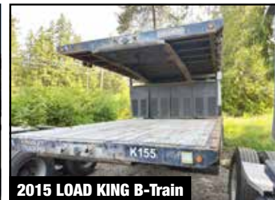
2015 LOAD KING B-Train