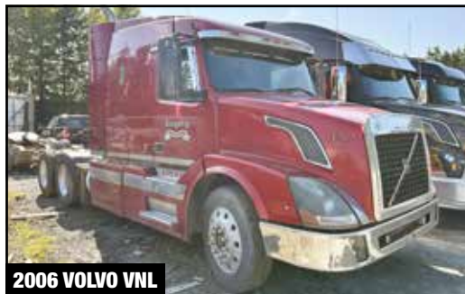
2006 VOLVO VNL