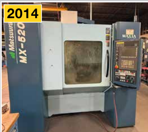
MATSUURA MX-520 CNC VMC