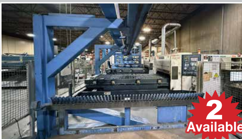
MAZAK Super Turbo X48MKII 2,500 Watt Co2 CNC Laser System