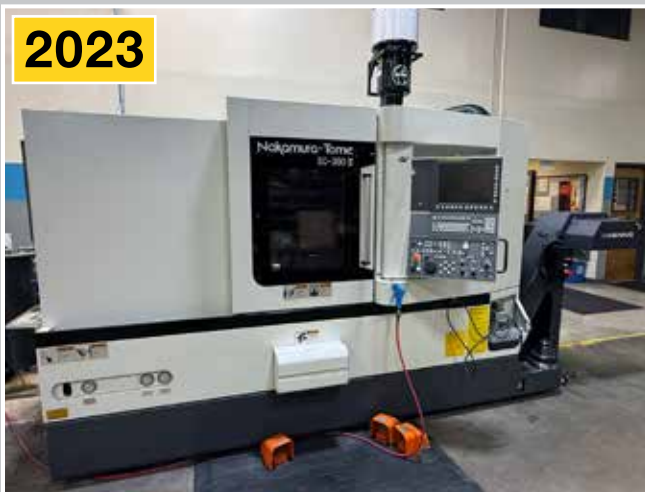
NAKAMURA-TOME SC-300II Multi-Axis CNC Lathe