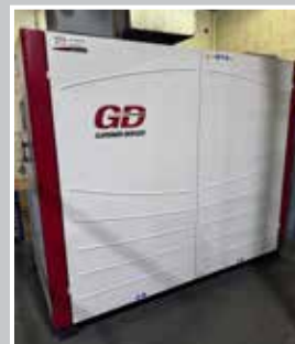
GD VS50 Air Compressor

Place your bid now! Register at: BidSpotter