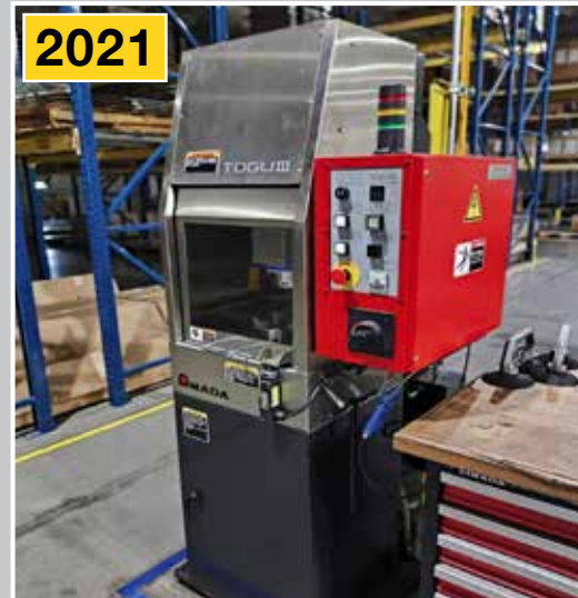
AMADA Togu-III Grinder/Punch