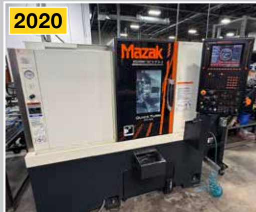
MAZAK Quick Turn 100SG CNC Turning Center