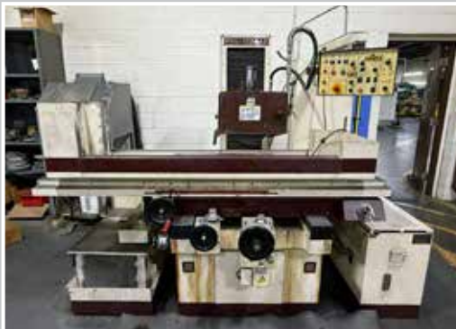
CHEVALIER FSG1224AD Surface Grinder