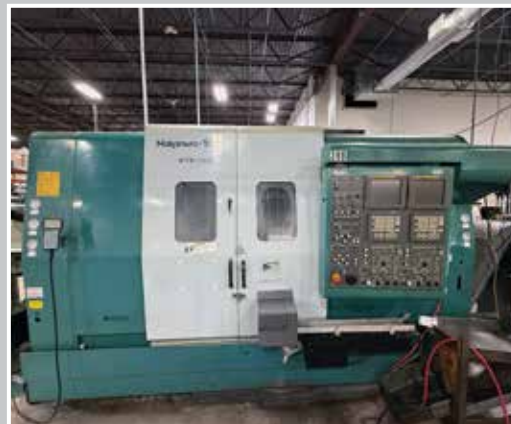
NAKAMURA WTW-150 CNC 6 Axis Turning Center