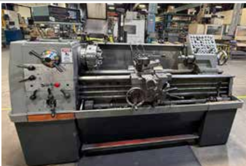
CLAUSING Colchester 15" x 50" Lathe