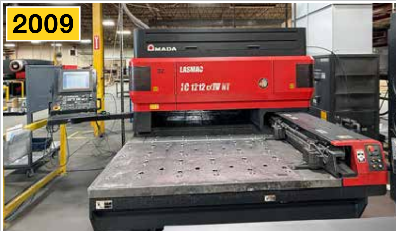
AMADA LC1212A4NT 4,000 Watt CNC Laser Cutter