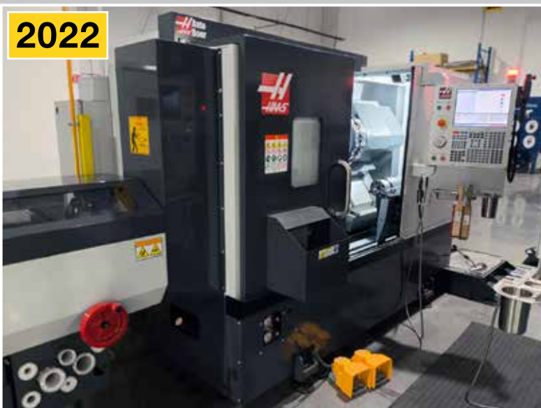
HAAS ST-25Y CNC Turning Center