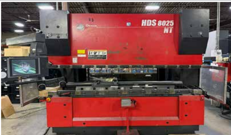
AMADA HDS 8025NT CNC Press Brake