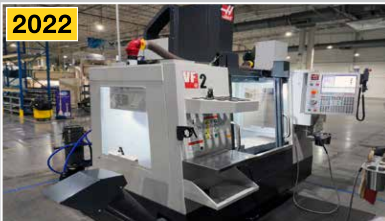
HAAS VF-2 CNC Vertical Machining Center