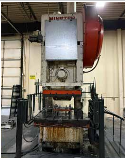
MINSTER G1-200 Gap Frame Press