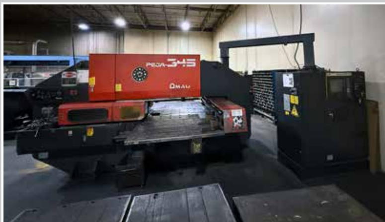
AMADA Pega 345 CNC Turret Punch