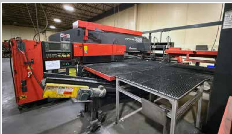
AMADA Vipros King II 358 CNC Turret Punch