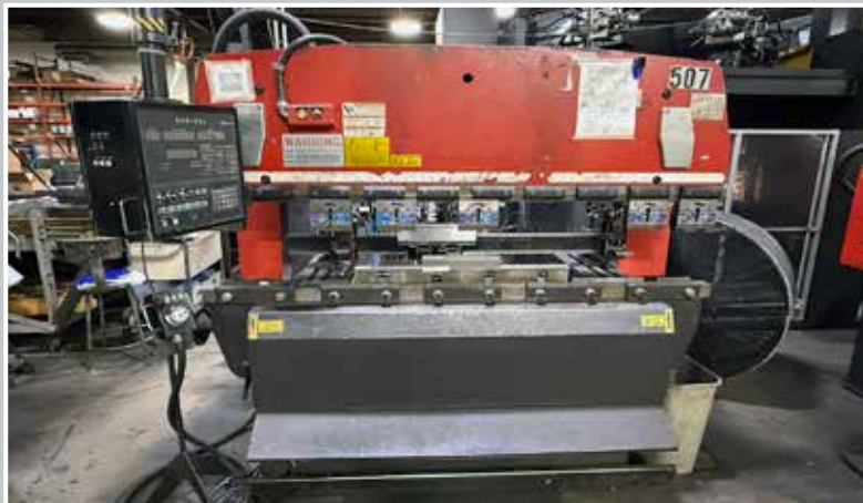
AMADA HFE80-25 CNC Press Brake