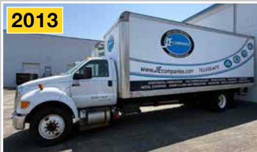
FORD F750 Van Truck