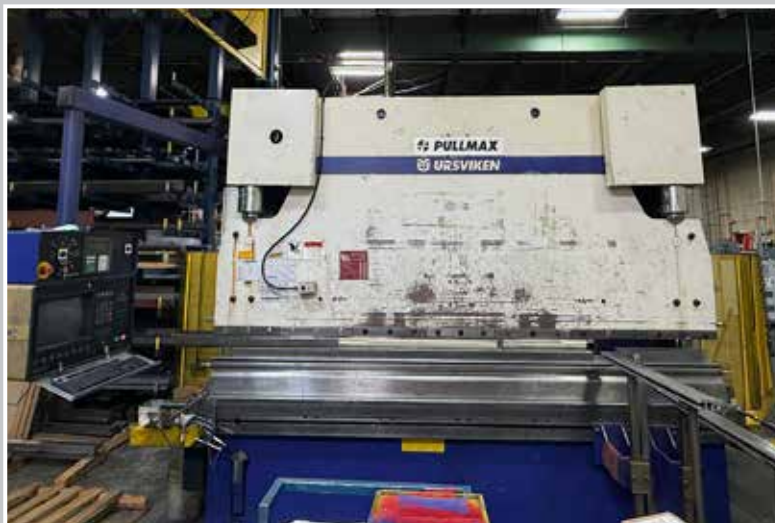
PULLMAX Optima 250/37/316 CNC Press Brake