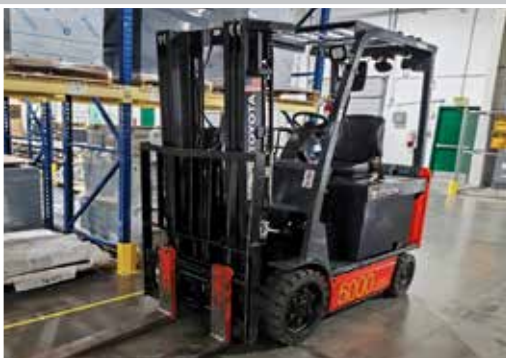
TOYOTA 5,000 Lb. Electric Forklift

TERMS & CONDITIONS | PAYMENT: Full payment within 24 hours. Payment is Cash, Cashier's check, Certified Check or Wire Transfer. No other forms of payments will be accepted. Full Payment Must be Made before removal of Purchase. Everything is Sold "As-Is, Where-Is". All Sales Final. Cost and Responsibility for Removal of Purchase Remains with the Purchaser. Every Effort will be Made to Facilitate Removal. While Qty. and Descriptions are Believed to be Accurate, the Auctioneer, Owners or Counsel Make no Warranties or Guarantees Either Expressed or Implied as to Authenticity, Genuineness of or Defects in Any Lot & will not be Held Responsible for any Advertising Discrepancies or Inaccuracies. No Warranties Whatsoever are Made as to Condition Merchantability or Fitness for Use of Any Item. May we Suggest you Take Full Advantage of the Preview and Inspection Period. Sale Subject to Additions and Deletions. Please Check Availability of Equipment. Last Date of Removal is to be Determined.