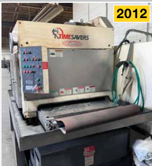
TIMESAVER Wide Belt Sander