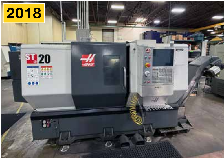
HAAS ST-20 CNC Turning Center