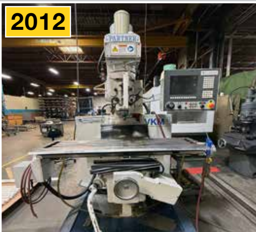
MILLTRONICS Partner VKM4 Vertical Mill