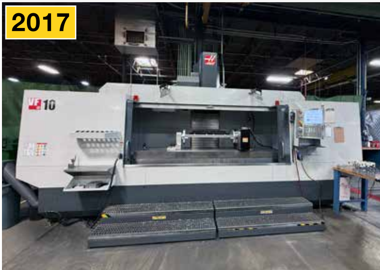
HAAS VF-10/40 CNC Vertical Machining Center