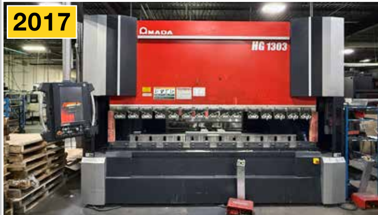
AMADA HG1303 CNC Press Brake