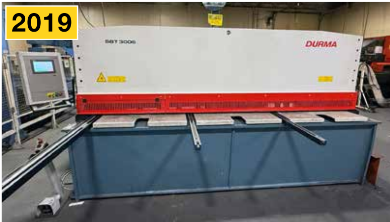
DURMA SBT3006 Shear