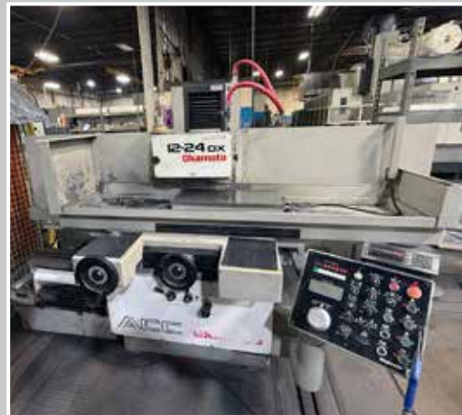
OKAMOTO ACC 12-24DX Surface Grinder