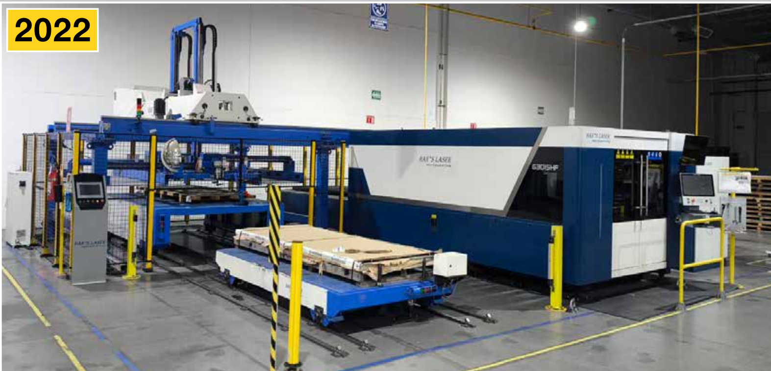
HANS LASER G3015HF, 3KW Fiber Laser