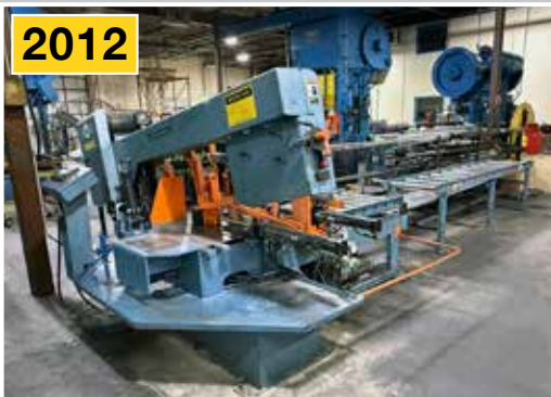
DOALL 500 SNC Horizontal Saw