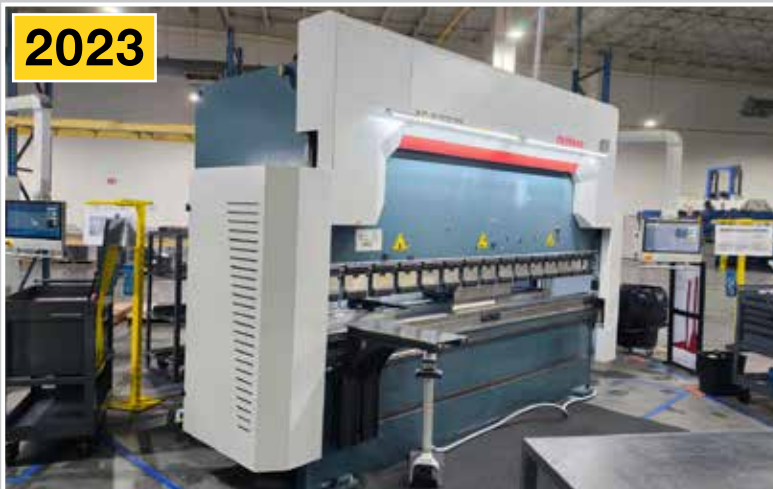
DURMA-LAZAR AD-R-30135 CNC Press Brakes