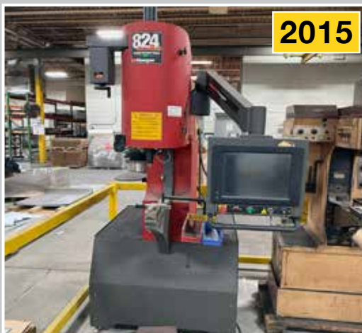
HAEGER 824WT-4He Insertion Press