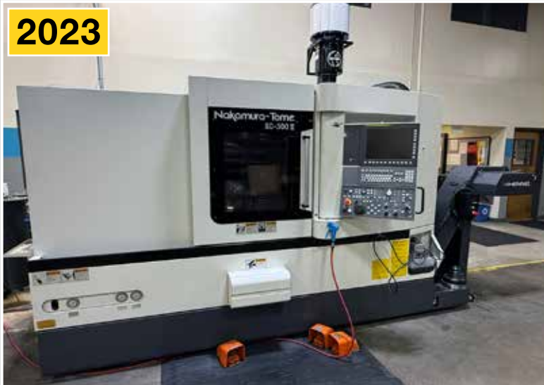
NAKAMURA-TOME DC-300 II CNC Turning Center