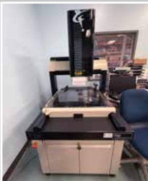
OGP Optical Inspection System