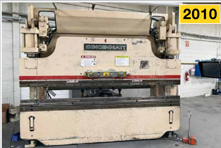
CINCINNATI 135PF X 10ft CNC Press Brake