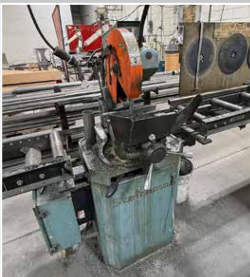
SCOTCHMAN Cold Saw