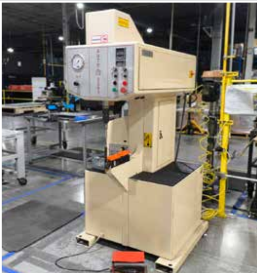
AUTO-SERT AS-7.5 Insertion Press