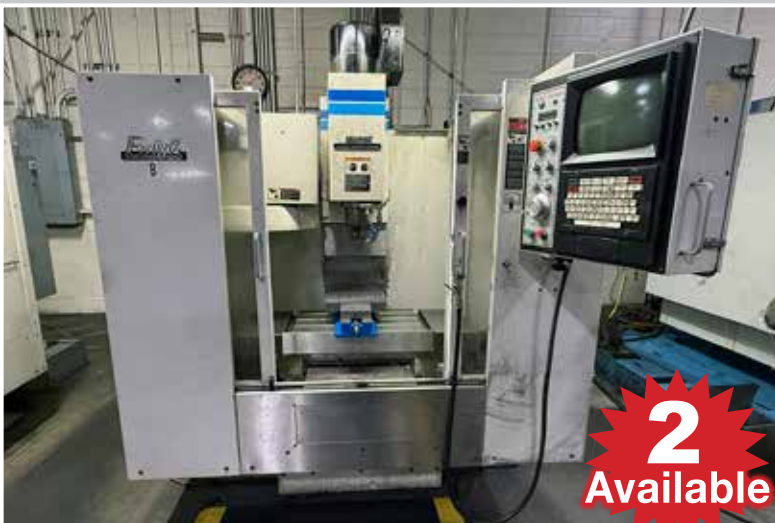
FADAL VMC-15 CNC Vertical Machining Center