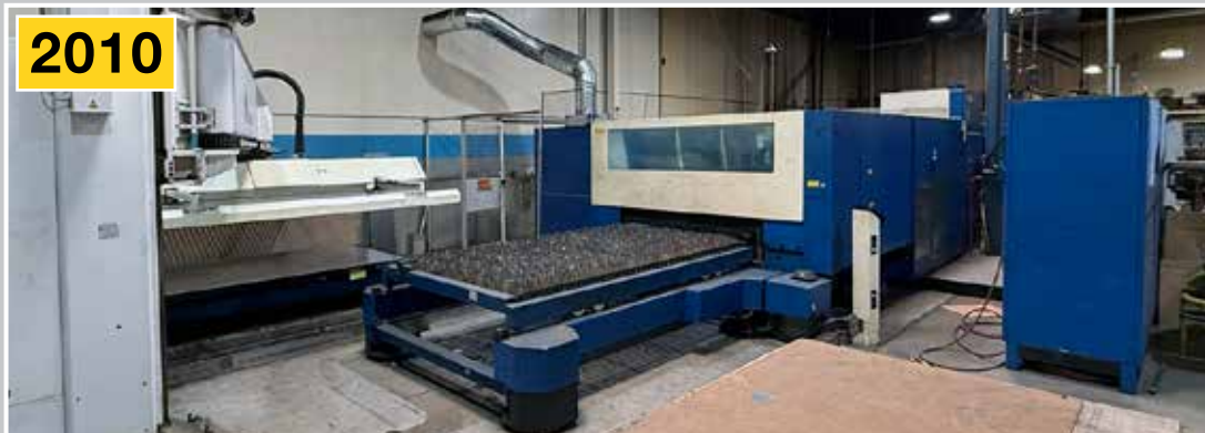
TRUMPF 5030/6000 Watt CNC Laser