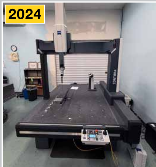
ZEISS Contura 12/18/8 CMM

For Further Information Email: customerservice@maynards.com