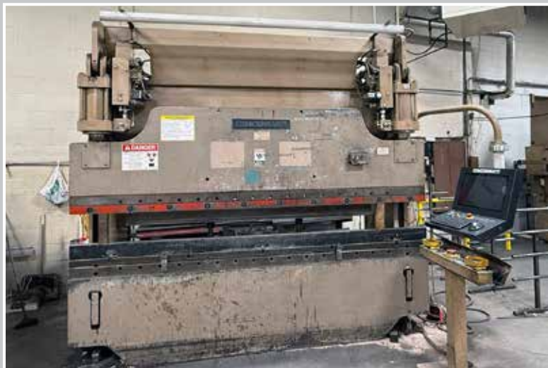
CINCINNATI 135PF X 8ft CNC Press Brake