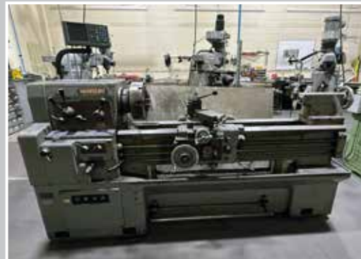
MORI SEIKI 17" x 50" Lathe