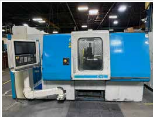
DENN ZENN 100 Metal Spinning Lathe