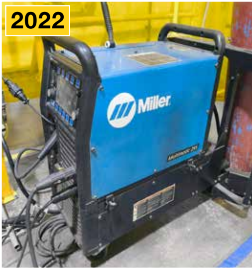
MILLER 255 Welder