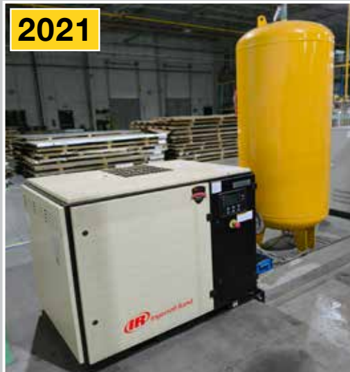
INGERSOLL RAND 30 HP Air Compressor