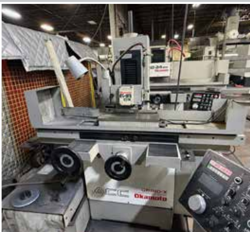
OKAMOTO ACC 6-18DX3 Surface Grinder