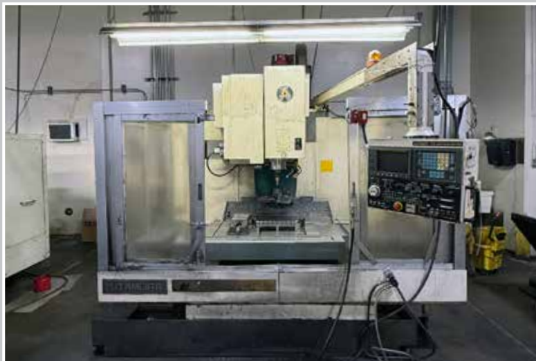
KITAMURA Mycenter 3 CNC Vertical Machining Center