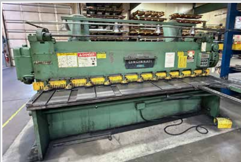
CINCINNATI 1810 Power Squaring Shear