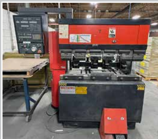
AMADA FDB-3512E CNC Press Brake