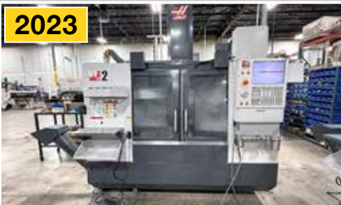
HAAS VF-2 CNC Vertical Machining Center