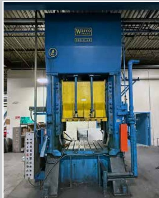
WARCO 250-Ton Straight Side Press