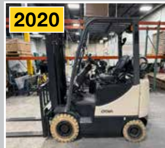
CROWN 4,000 Lb. Cap. Forklift

For Further Information Email: customerservice@maynards.com