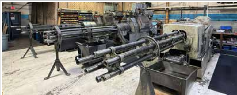
View of Screw Machines