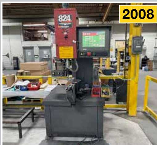
HAEGER 824WT-3H Insertion Press