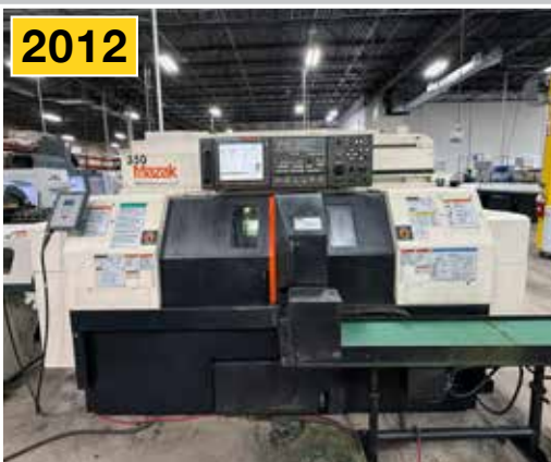
MAZAK Multiplex 6200-IIY CNC Turning Center