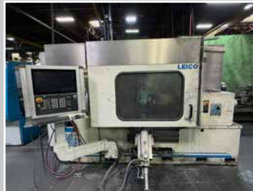
LEICO PNC75 Metal Spinning Lathe