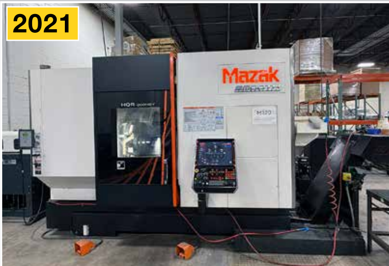
MAZAK HQR-200MSY CNC Twin Spindle CNC Turning Center