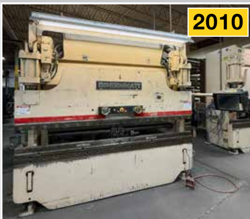
CINCINNATI 90PF x 8ft CNC Press Brake