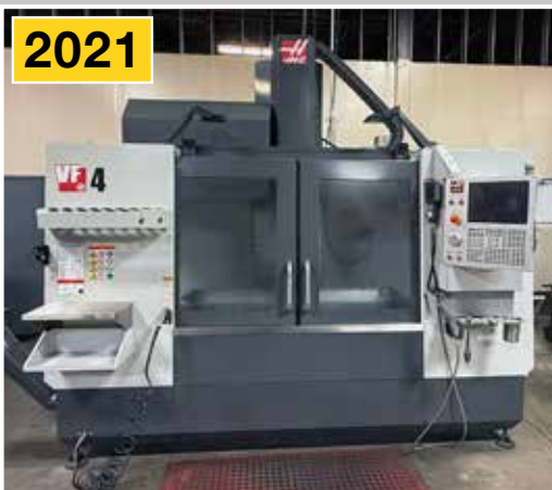
HAAS VF-4 CNC Vertical Machining Center