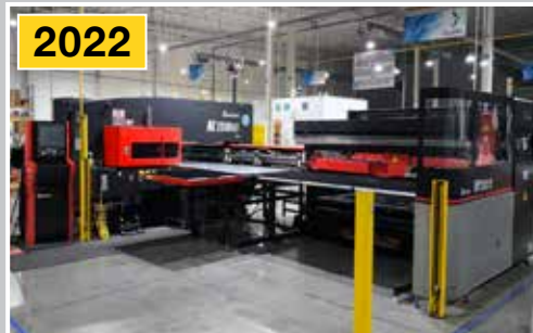
AMADA AE2510NT CNC Turret Punch

For Further Information Email: customerservice@maynards.com