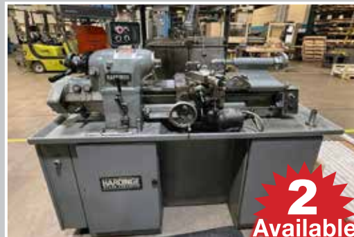
HARDINGE HLV-H Tool Room Lathe