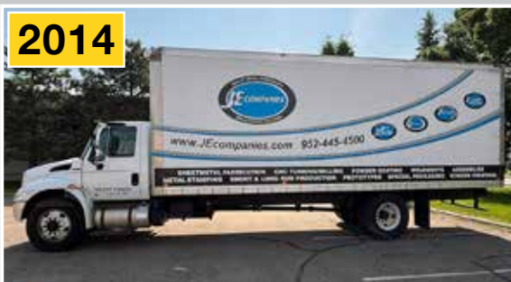
PETERBILT 337 Van Truck