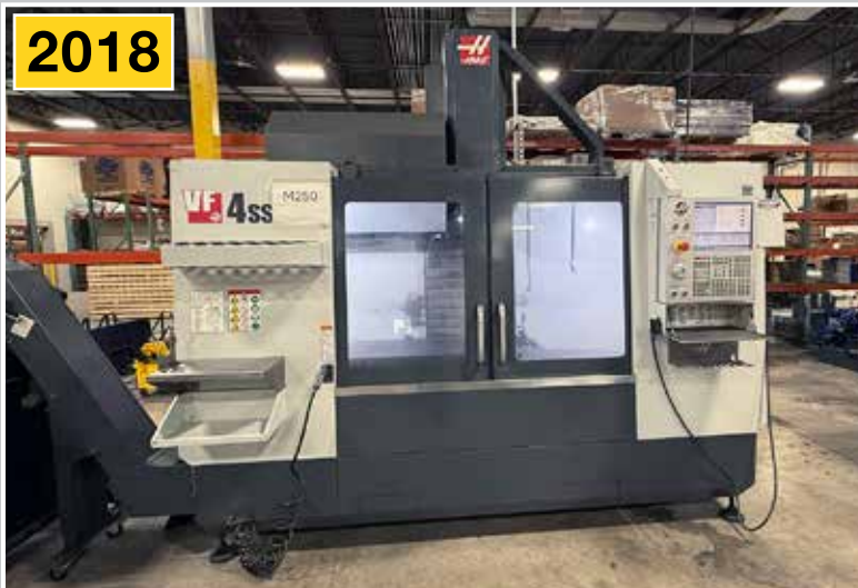
HAAS VF-4SS CNC Vertical Machining Center