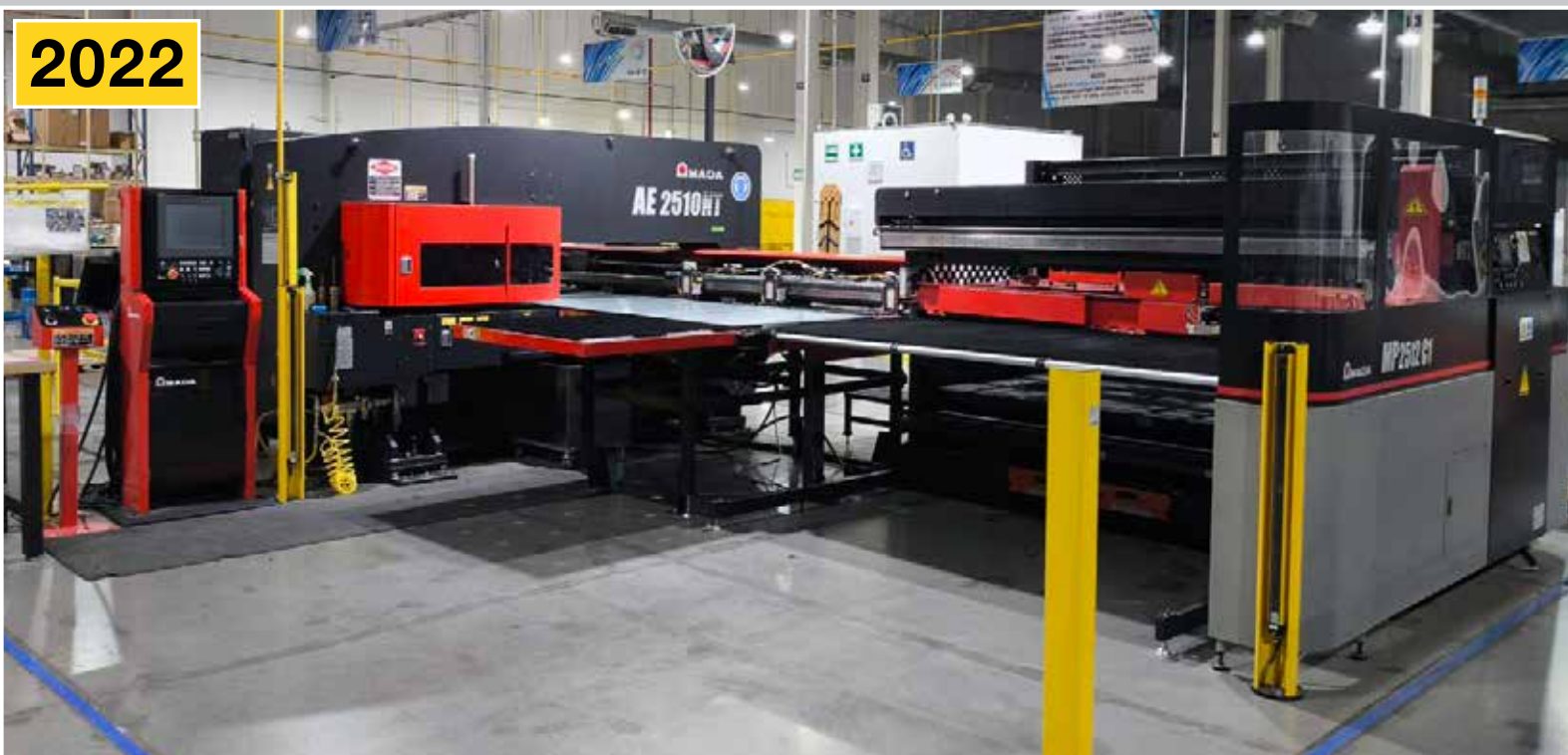
AMADA AE2510NT CNC Turret Punch