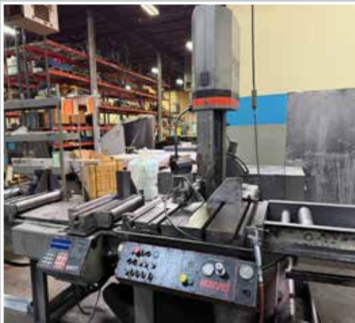
MARVEL 81A11PC Vertical Bandsaw