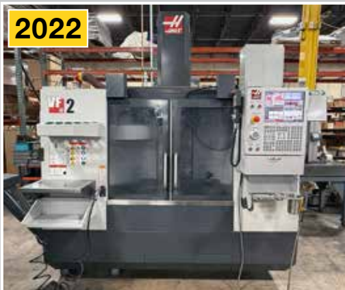
HAAS VF-2 CNC Vertical Machining Center