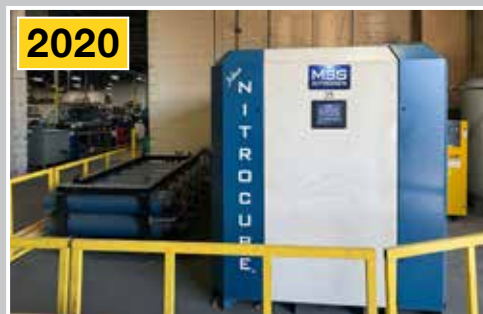
MSS NitroCube 2 Nitrogen Generator