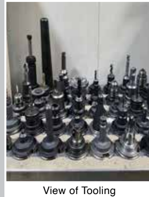
View of Tooling

Place your bid now! Register at: BidSpotter