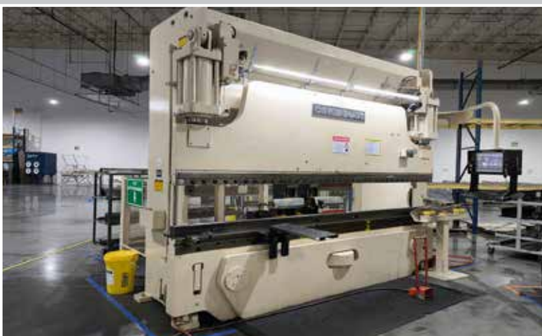
CINCINNATI 135F Press Brake