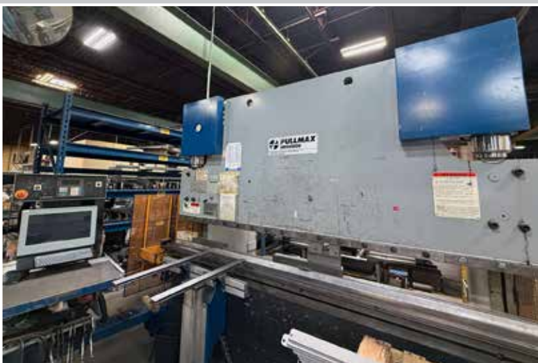
PULLMAX Optima 160/31/255 CNC Press Brake