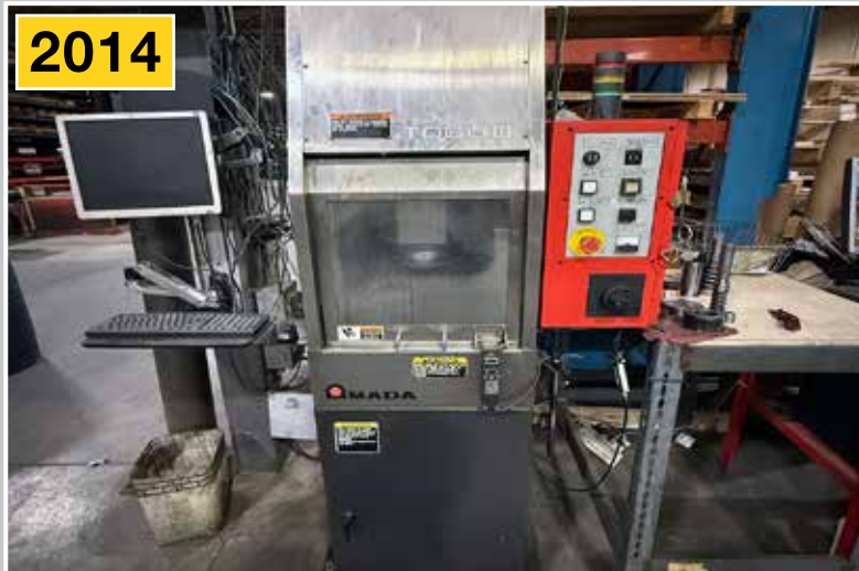
AMADA Togu III Grinder