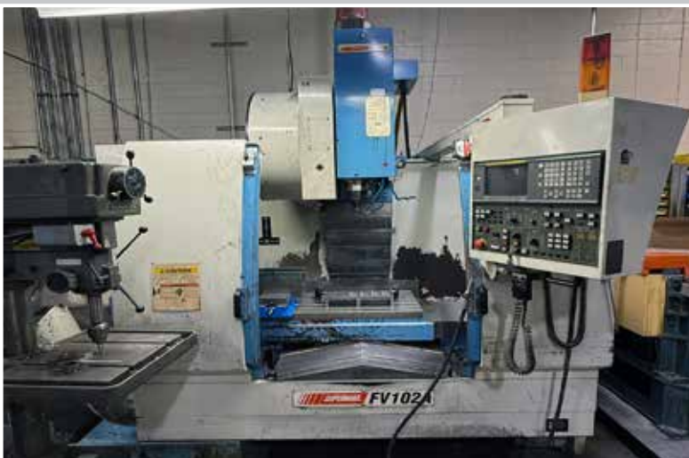
YCI Supermax FV-102A CNC Vertical Machining Center