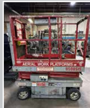
MAYVILLE 1632 Scissor Lift