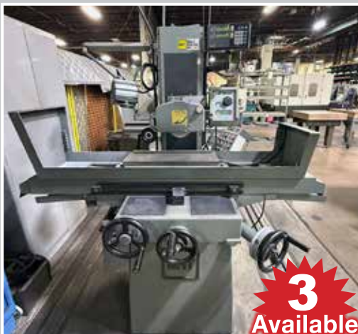
MHT 6" x 18" Surface Grinder