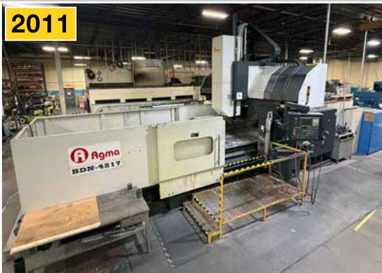
AGMA BDN-4217 CNC Bridge Type Vertical Machining Center