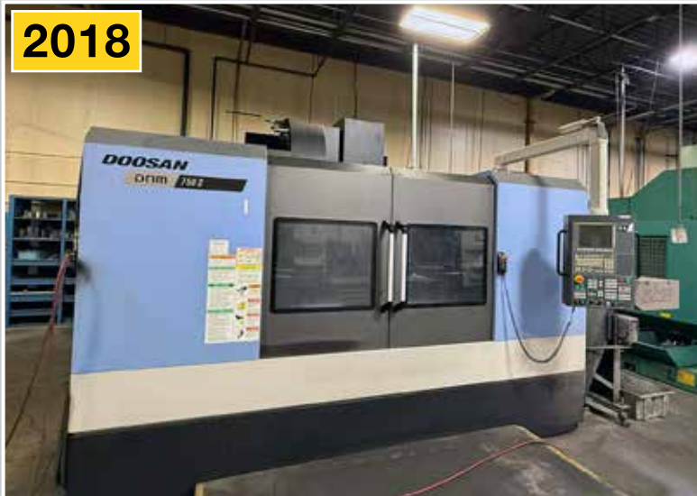
DOOSAN DNM750 II CNC Vertical Machining Center