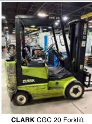
CLARK CGC 20 Forklift