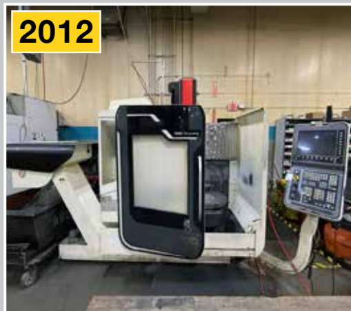
DMG MORI SEIKI DMU 50 Ecoline CNC VMC