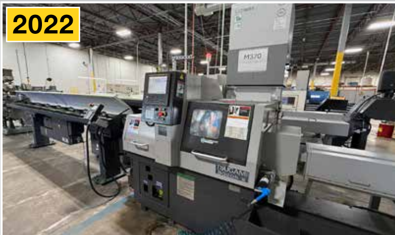
TSUGAMI B0205-III CNC Swiss Type 7-Axis CNC Turning Center