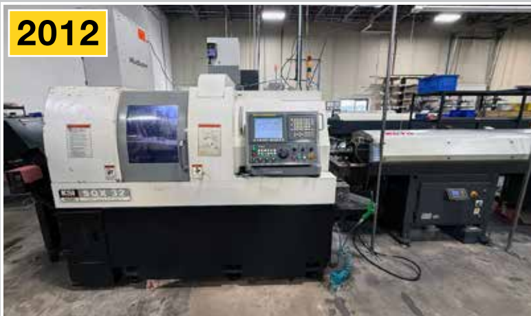
KSI SQX-32 CNC Swiss Type 7-Axis CNC Turning Center