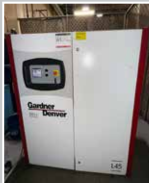
GD L30-45D Air Compressor