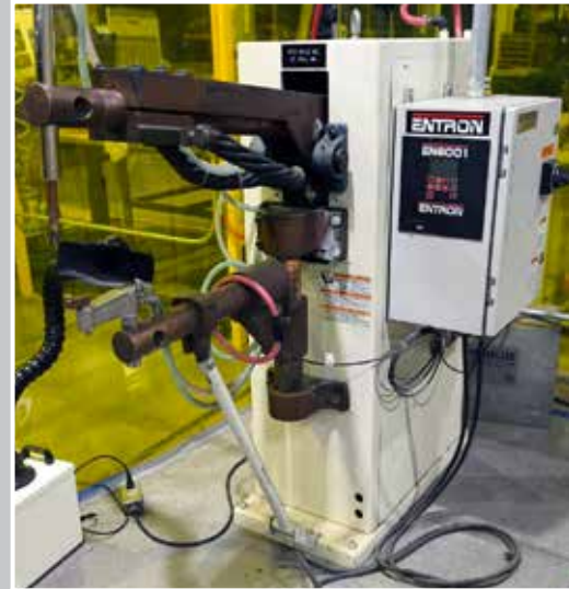
DT INDUSTRIES AR-475 75kva Spot Welder