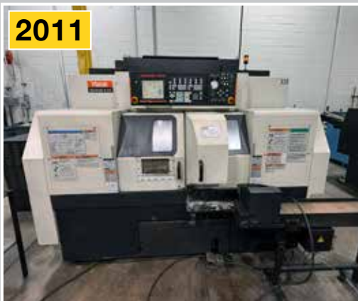
MAZAK Multiplex 6100 CNC Turning Center