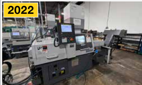
TSUGAMI CNC Swiss Type CNC Turning Center