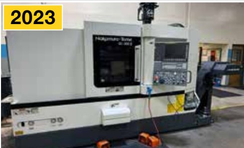
NAKAMURA-TOME SC-300II Multi-Axis CNC Lathe