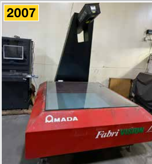
AMADA/VIRTEK Fabri Vision Inspection System