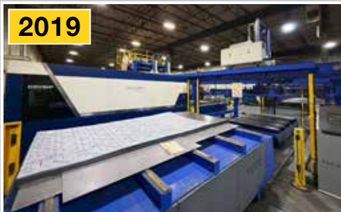
HANS 8,000W CNC Fiber Laser Cutting System