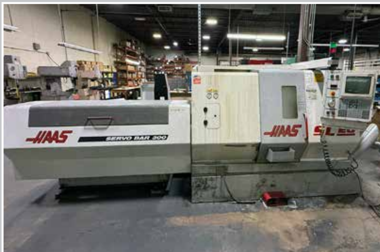
HAAS SL20T CNC Turning Center