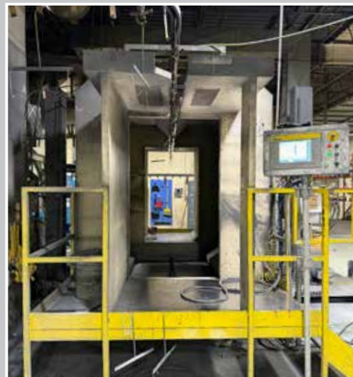
WAGNER PEA03-18 Paint System