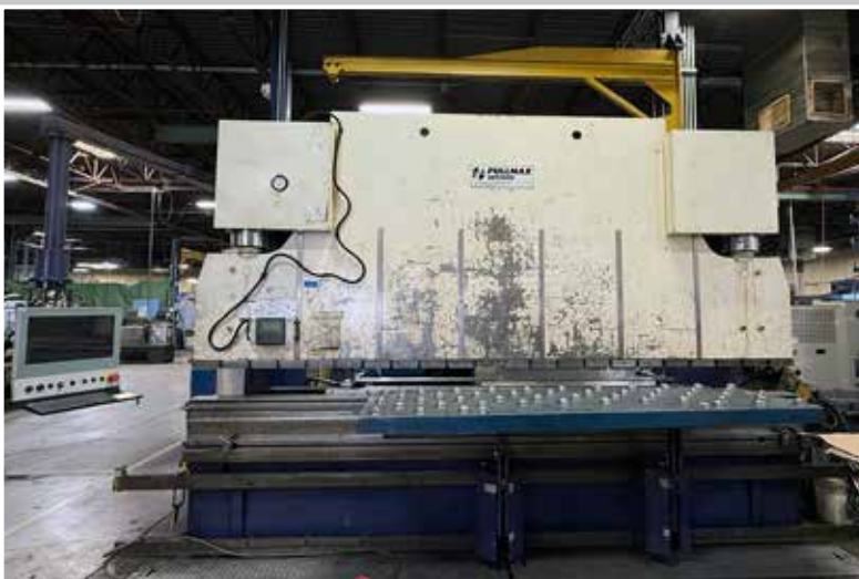
PULLMAX EKP-CNC440/14/12 CNC Press Brake