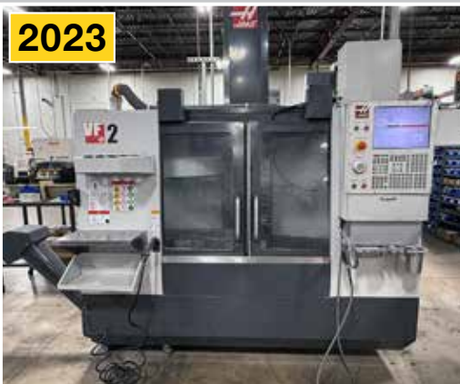
HAAS VF-2 CNC Vertical Machining Center