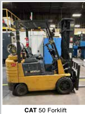
CAT 50 Forklift