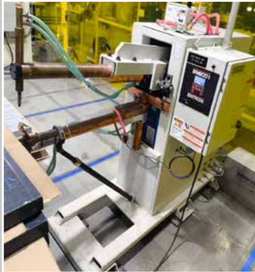
SPOTWELD Swi 80 kva Spot Welder