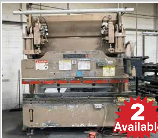
CINCINNATI 90FMII X 6ft CNC Press Brake