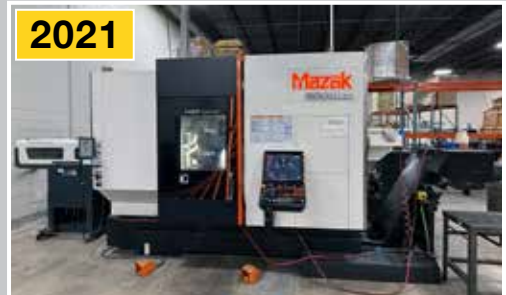
MAZAK CNC Twin Spindle CNC Turning Center