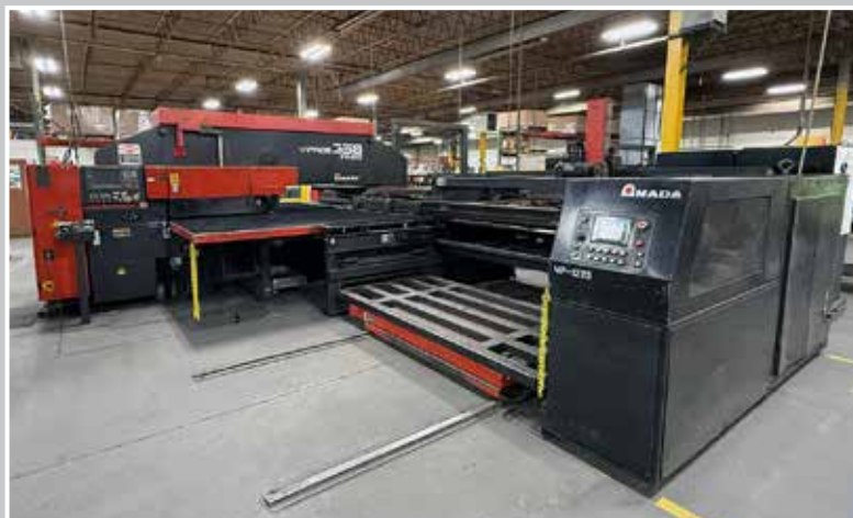
AMADA Vipros King II 358 CNC Turret Punch