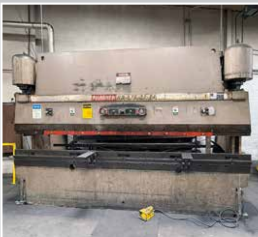
NIAGARA HD-175-12-14 Press Brake