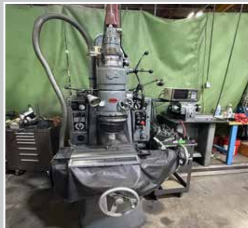
MOORE #2 Jig Grinder