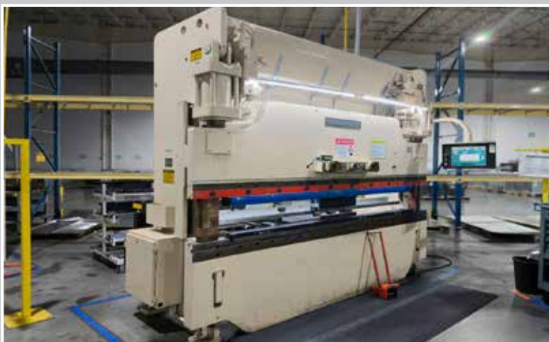
CINCINNATI 90 Press Brake