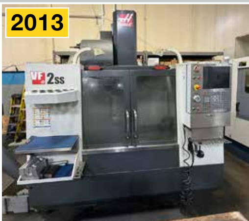
HAAS VF-2SS CNC Vertical Machining Center