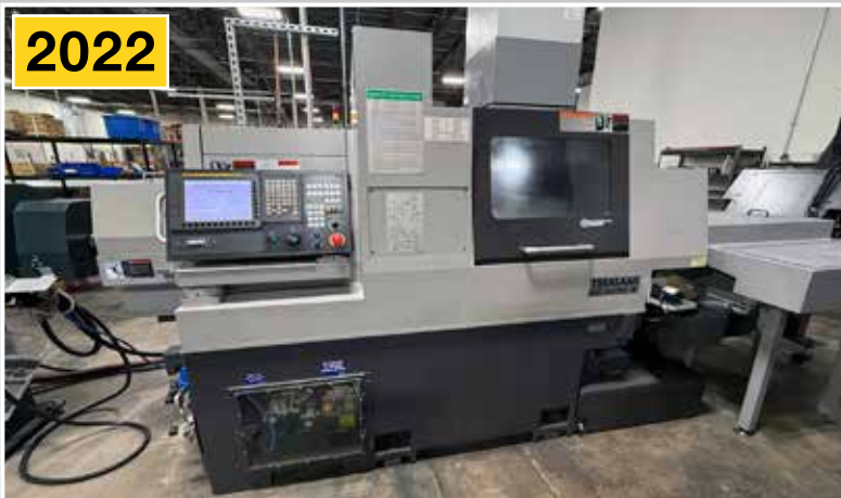
TSUGAMI B0325V-III CNC Swiss Type 7-Axis CNC Turning Center