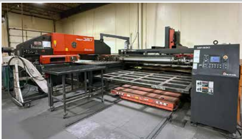
AMADA Pega 357 CNC Turret Punch