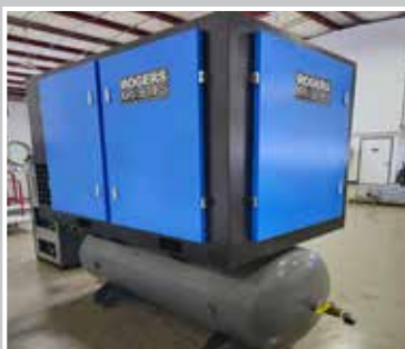
ROGERS KRV-40-125 Air Compressor