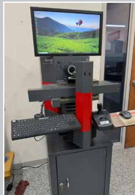
HDV 400 Horizontal Digital Comparator