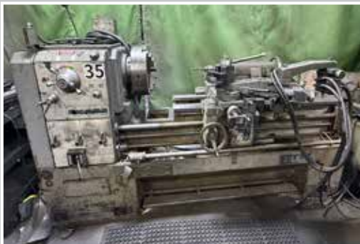
ECOTURN Z-160 26" x 60" Lathe