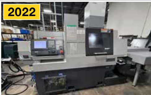
TSUGAMI CNC Swiss Type CNC Turning Center