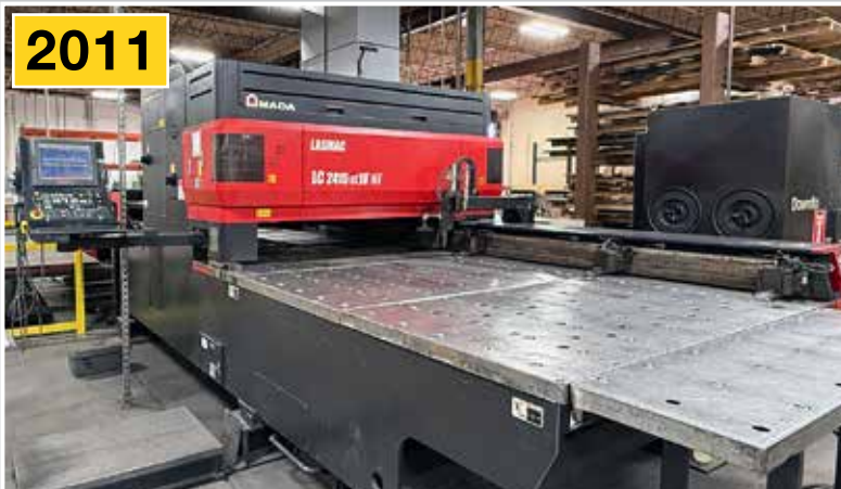
AMADA LC2415 CXIVNT 4,000 Watt CNC Laser Cutter