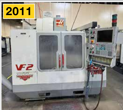
HAAS VF-2 CNC Vertical Machining Center