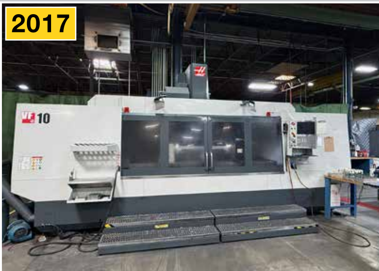
HAAS VF-10/40 CNC Vertical Machining Center