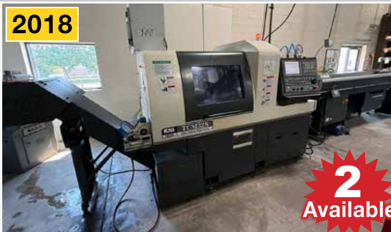
KSI TCM32S CNC Swiss Type 7-Axis CNC Turning Center