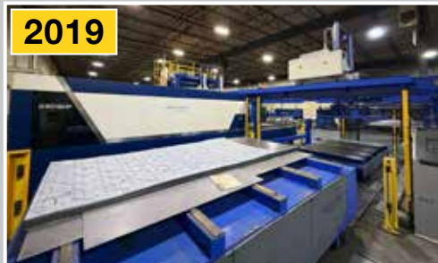
HANS 8,000 Watt CNC Fiber Laser Cutter