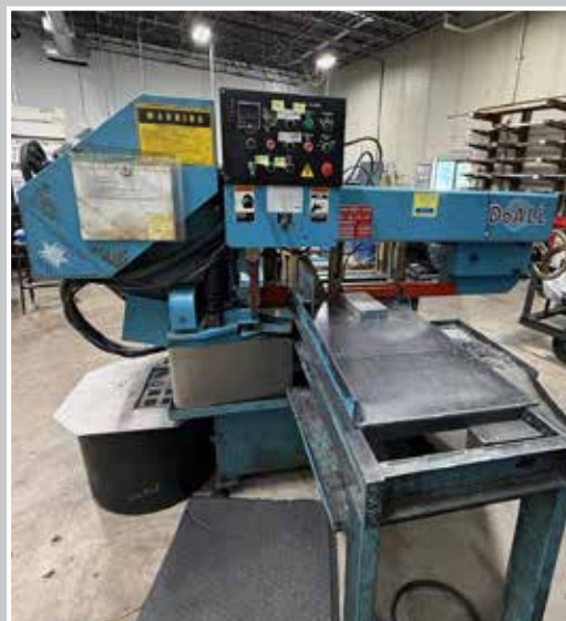
DOALL C-916 SA Horizontal Bandsaw