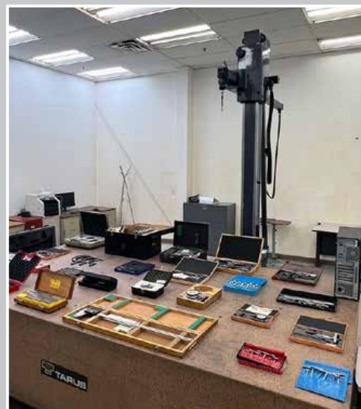
TARUS Horizontal Arm CMM & Inspection Equip.