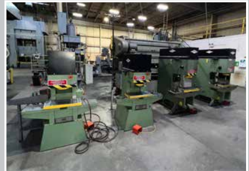
CLAUSING & KALAMAZOO Metal Muncher Ironworkers

For Further Information Email: customerservice@maynards.com