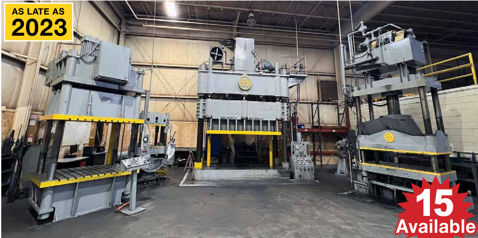
HPM, ST LAWRENCE, VERNON, WATSON RACINE, LAKE ERIE, EMCO, IET & DAKE Hydraulic 4-Post Presses, up to 2,500-Tons