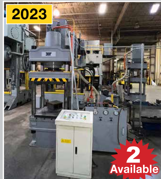
250-Ton IET 4-Post Hydraulic Press