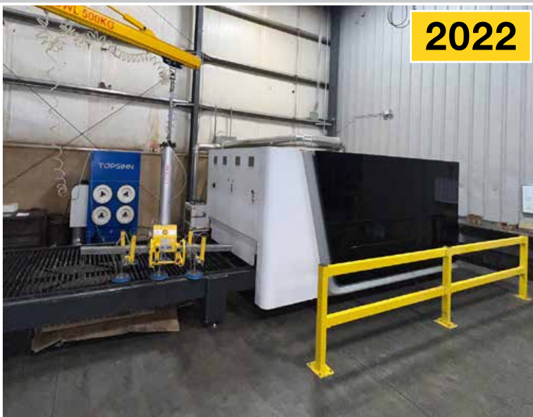
KOMATSU, NTC and BODOR CNC Laser Cutters