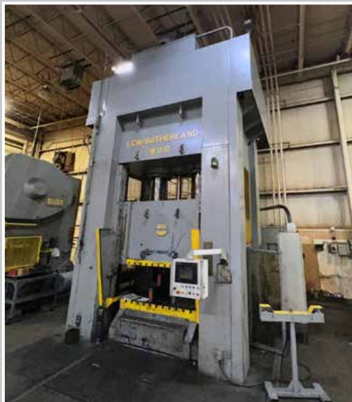
880-Ton SUTHERLAND/LIEN CHIEH SS Hyd. Press