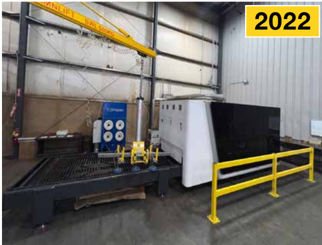
BODOR 3-Axis Fiber Laser

Thursday, July 10 @ 10am ET – Auburn Hills, MI