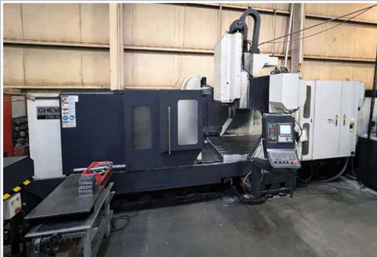
CHEVALIER Double Column CNC Vertical Machining Center/Bridge Mill