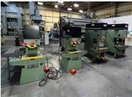
CLAUSING & KALAMAZOO Metal Muncher Ironworkers