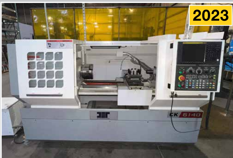
LUZHONG CK 6140 Flat Bed CNC Lathe (Unused)