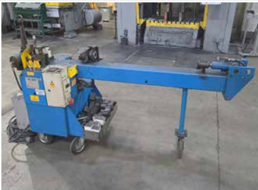
TRACTO TECHNIK Turbobend 48 Tube Bender