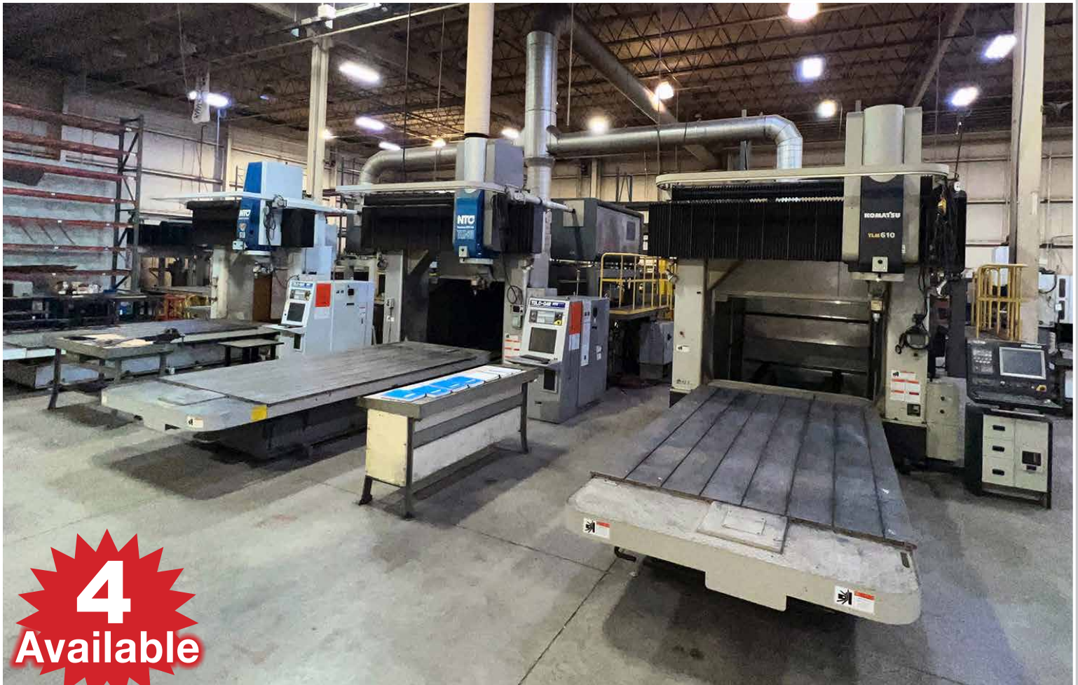
KOMATSU, NTC and BODOR CNC Laser Cutters

ASSET LOCATION: 3199 Lapeer Road, Auburn Hills, MI 48326