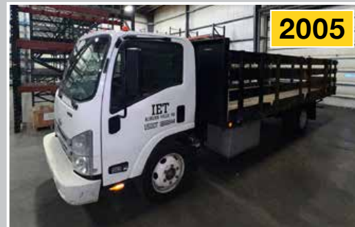
CHEVROLET C4500 Truck, with 14' Stake Bed