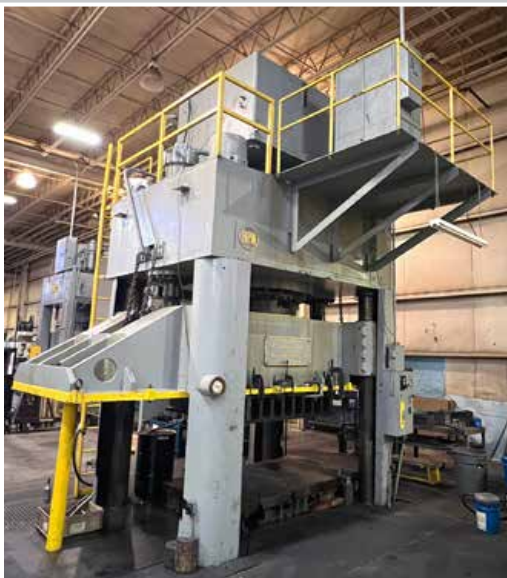
2,500-Ton HPM 4-Post Hydraulic Press