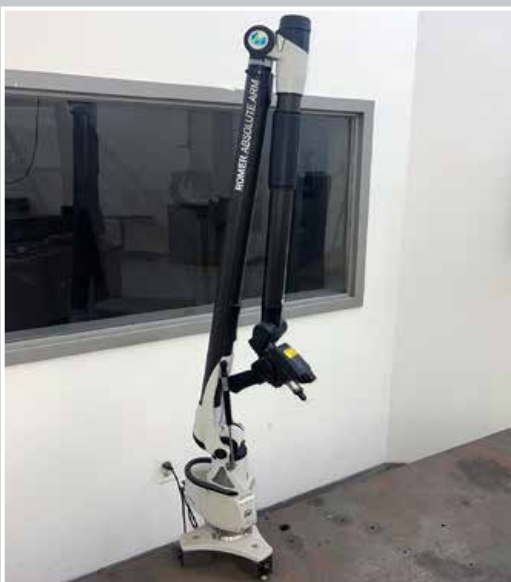
ROMER ABSOLUTE 7-Axis High Accuracy Arm