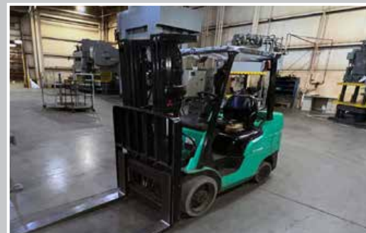
MITSUBISHI FGC30N Forklift Capacity 5,750 Lbs.