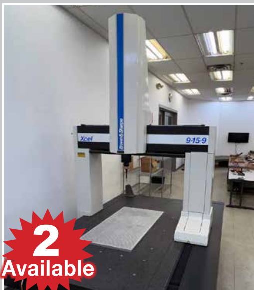
BROWN & SHARPE Xcel 9-15-9 CMM