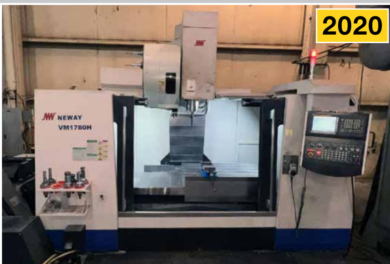
NEWAY VM1780H CNC Vertical Machining Center