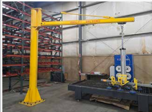
Jib Crane and Sheet Lifter