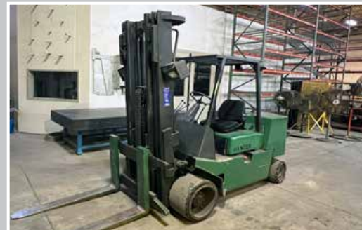
HYSTER S120XLS Forklift, Capacity 11,350 Lbs.