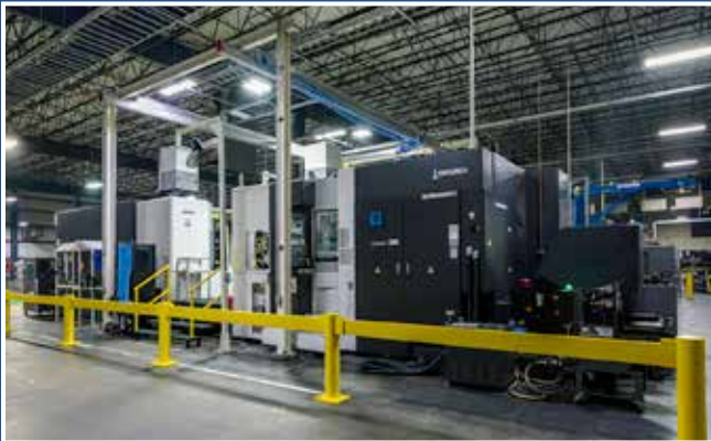
Carrier Case Line

ALL EQUIPMENT IS INSTALLED AND UNDER POWER