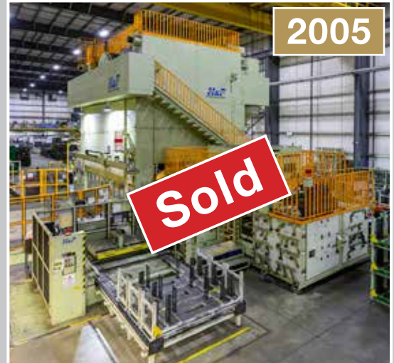
HITACHI Zosen Fukui (H&F) 2,810-ton Transfer Press