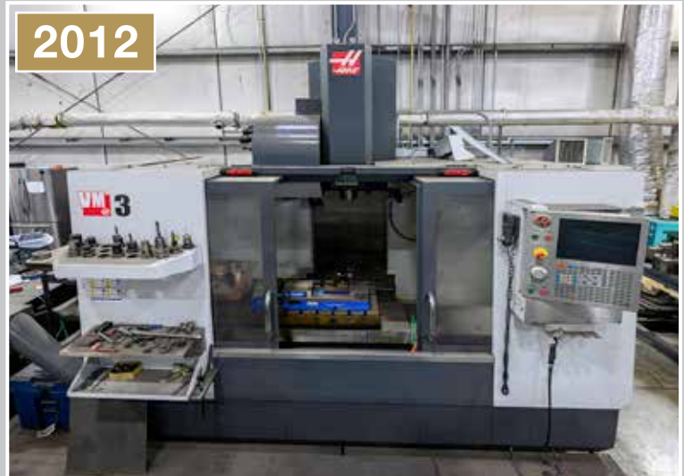
HAAS VM-3 CNC Vertical Machining Center