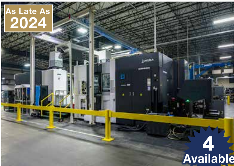
OKUMA MA-500H II CNC Horizontal Machining Center