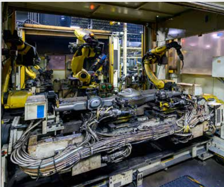
Housing Weld Line