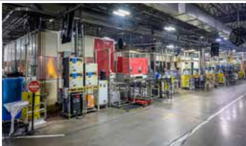
Housing Weld Line