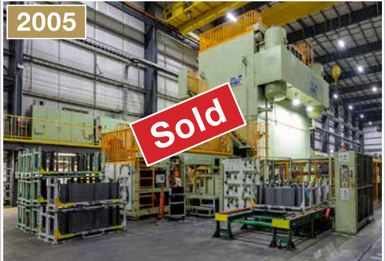
HITACHI Zosen Fukui (H&F) BFE13000 Blanking Press & Coil Line