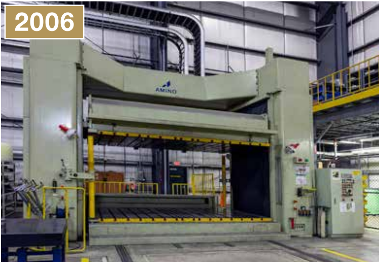
AMINO DRM1000 Center Reversing Type Die Spotting Press