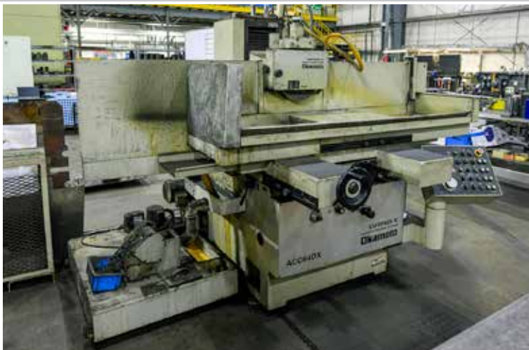
OKAMOTO Hydraulic Surface Grinder