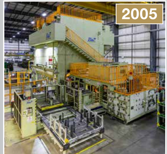
HITACHI Zosen Fukui (H&F) 2,810-ton Transfer Press