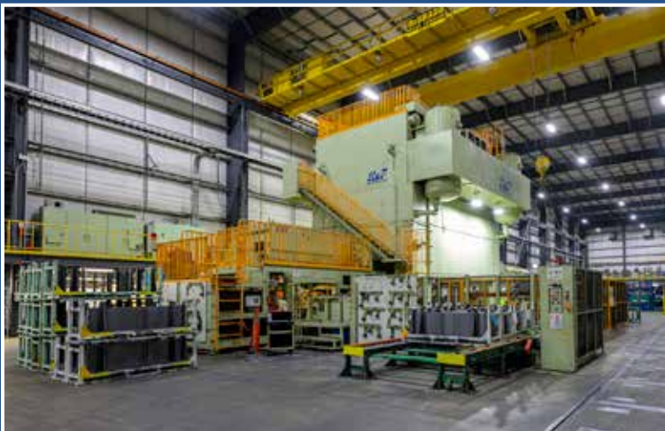
HITACHI Zosen Fukui (H&F) BFE13000 Blanking Press & Coil Line