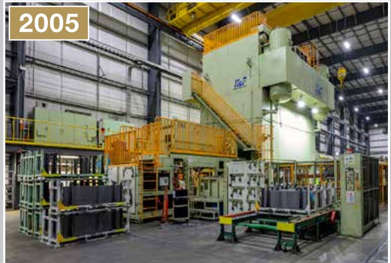
HITACHI Zosen Fukui (H&F) BFE13000 Blanking Press & Coil Line